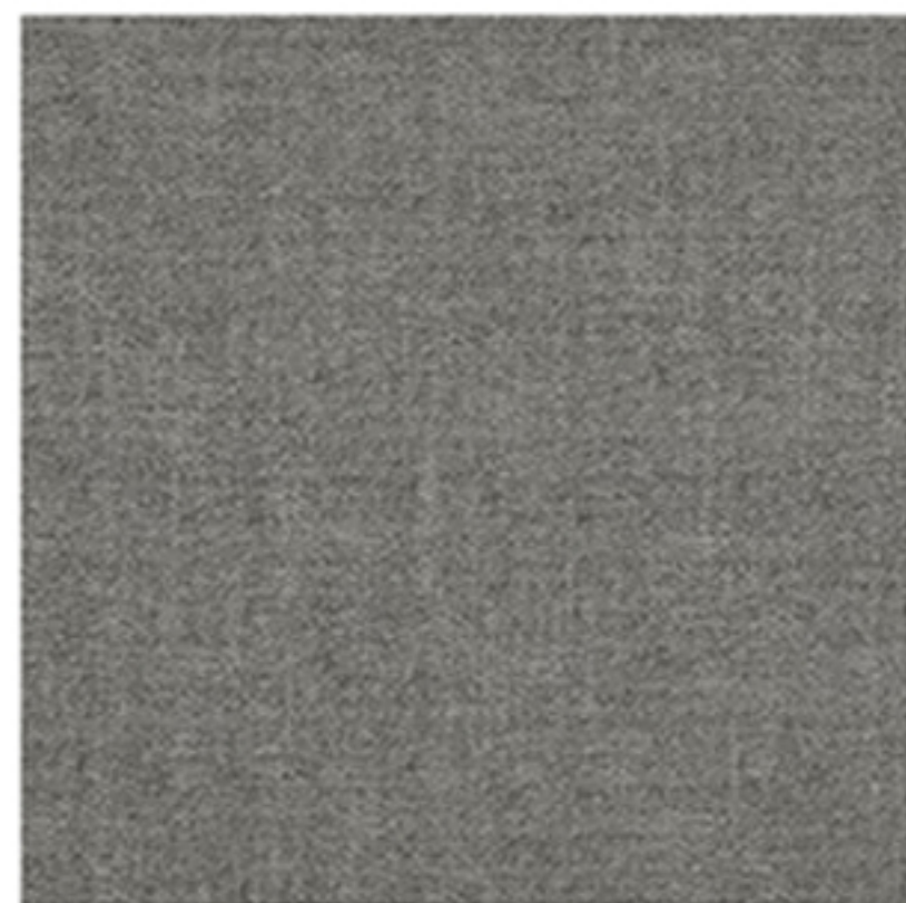
INTERVIEW ACIER Ref : 36910258