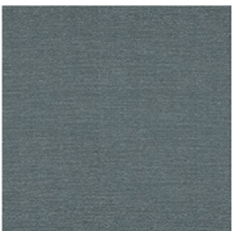
INTERVIEW ORANGE Ref : 36911062