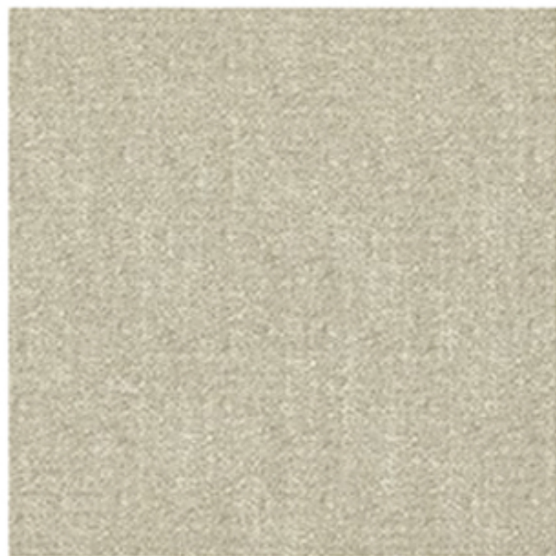
INTERVIEW NEIGE POUDEE Ref : 36910541