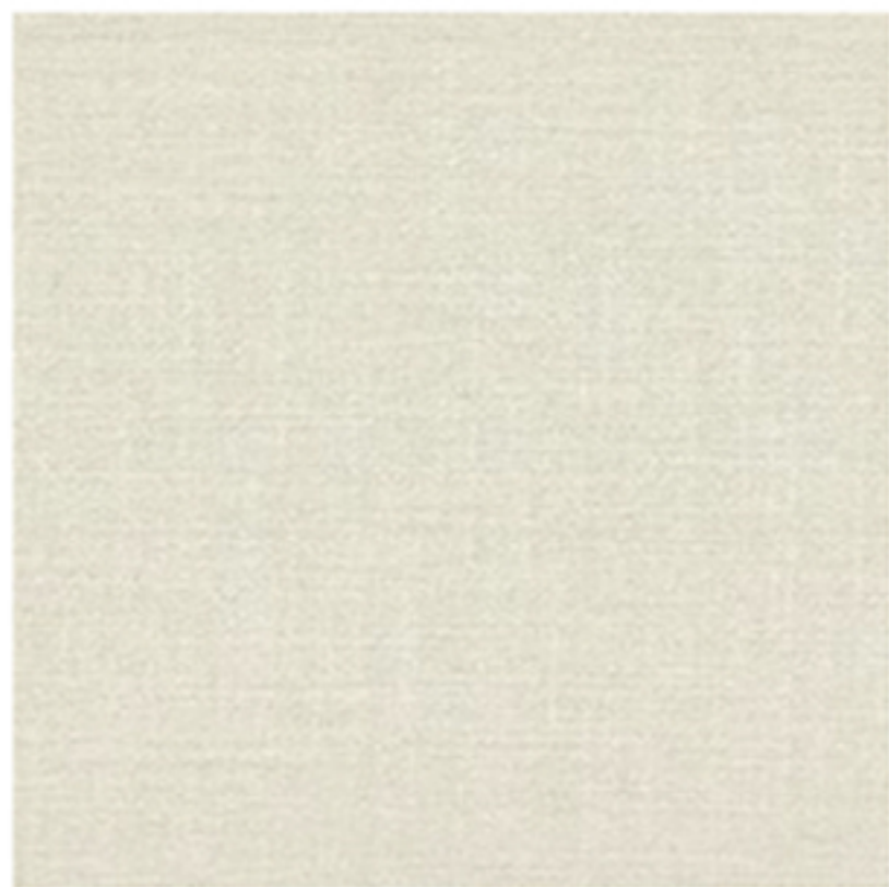
INTERVIEW BLANC PETALE Ref : 36910482