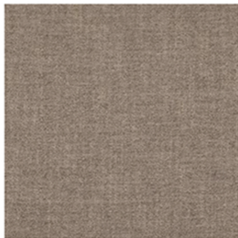
INTERVIEW BEIGE TAUPE Ref : 36910816