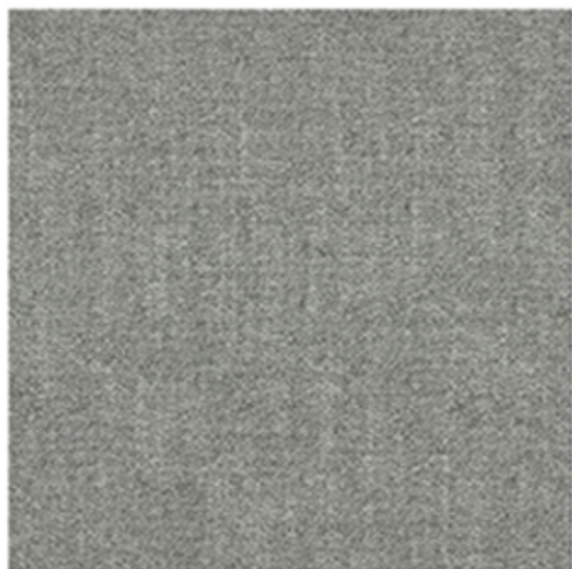
INTERVIEW CRAIE Ref : 36910732