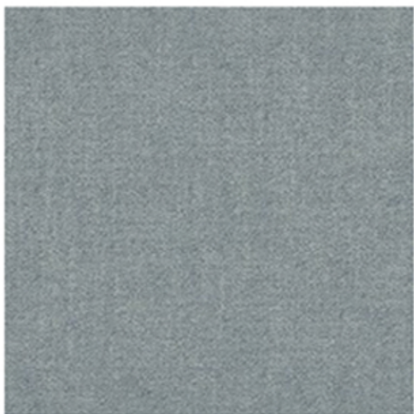
INTERVIEW GLACIER Ref : 36911138