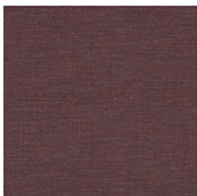
INTERVIEW LIE DE VIN Ref : 36911379

Interview 3691 ... 55" +/- 140 cm 40% viscose 33% cotton 11% linen 11% acrylic 5% polyester +/- 550 g/m 2 → 0 W = 60,000 double rubs M = 40 000 cycles Country of origin : Italy