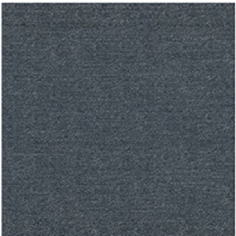
INTERVIEW MARINE Ref : 36911243