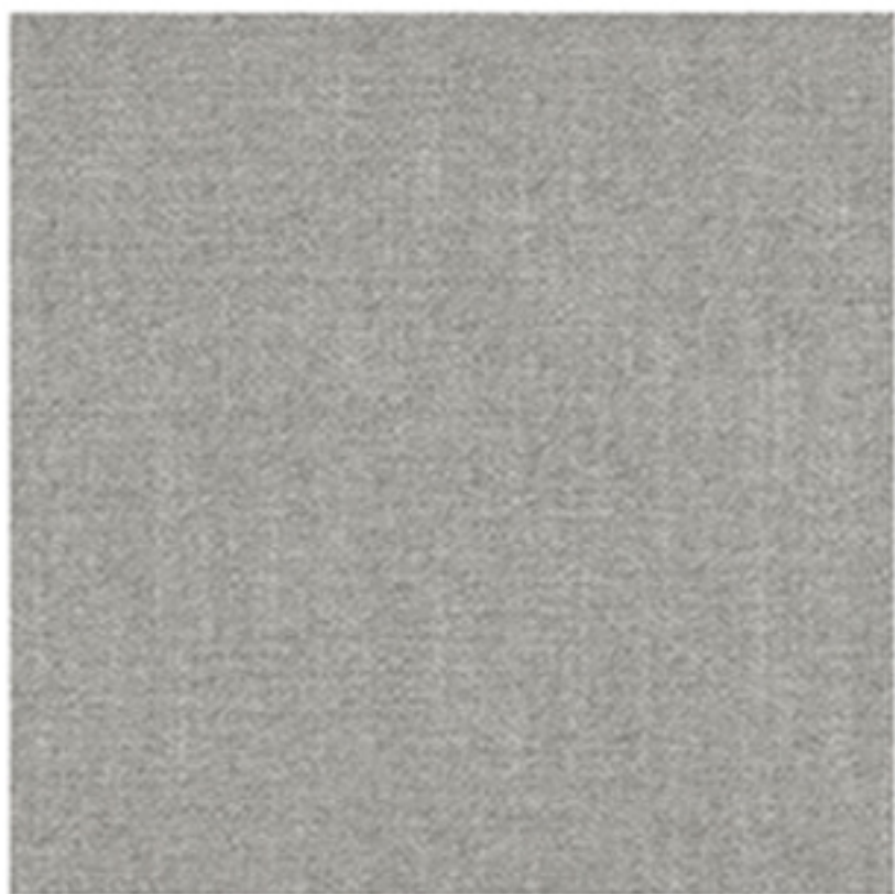
INTERVIEW GRIS PERLE Ref : 36910145