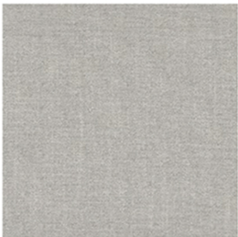
INTERVIEW TOURTERELLE Ref : 36910674