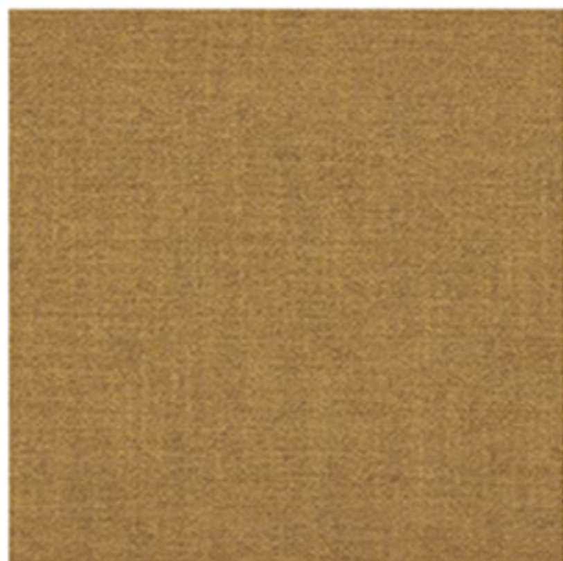
INTERVIEW JAUNE Ref : 36910973