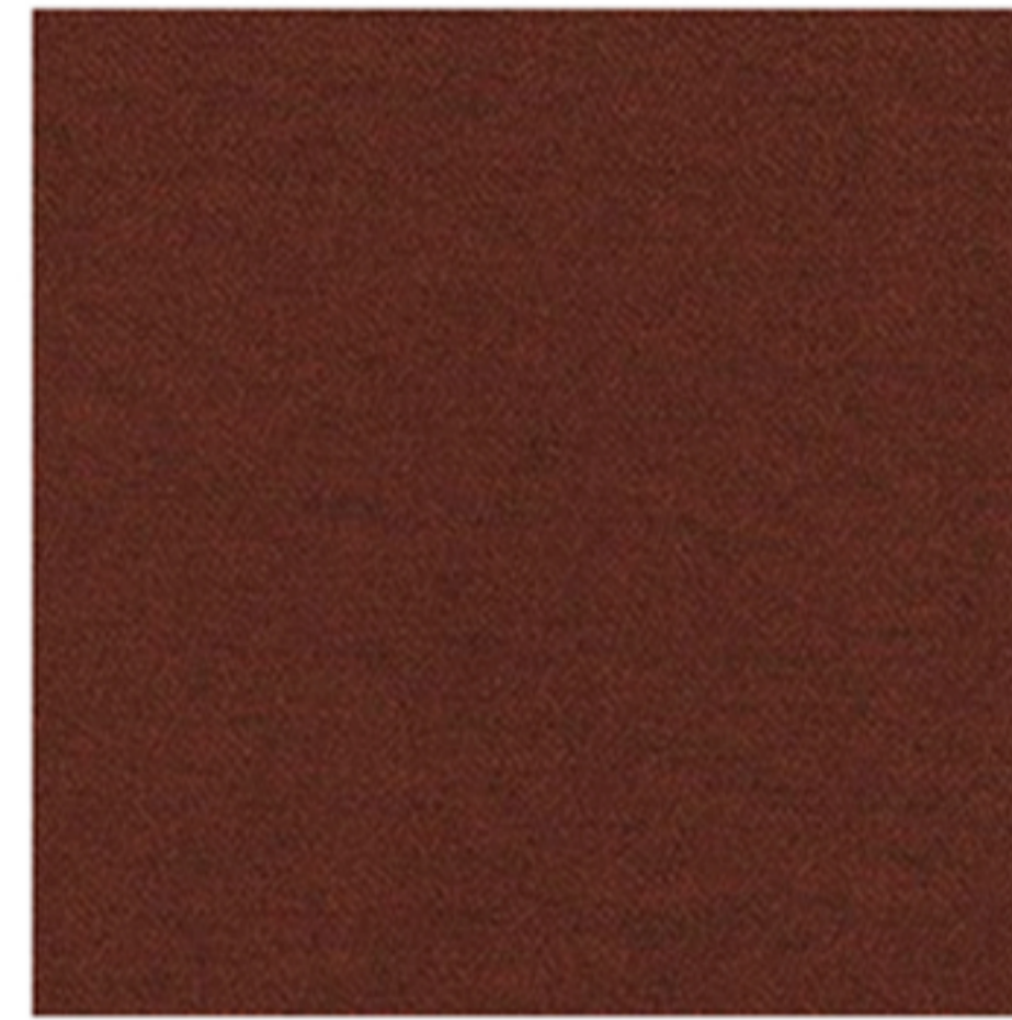
JACOB ORANGE BRULEE Ref : 40981059