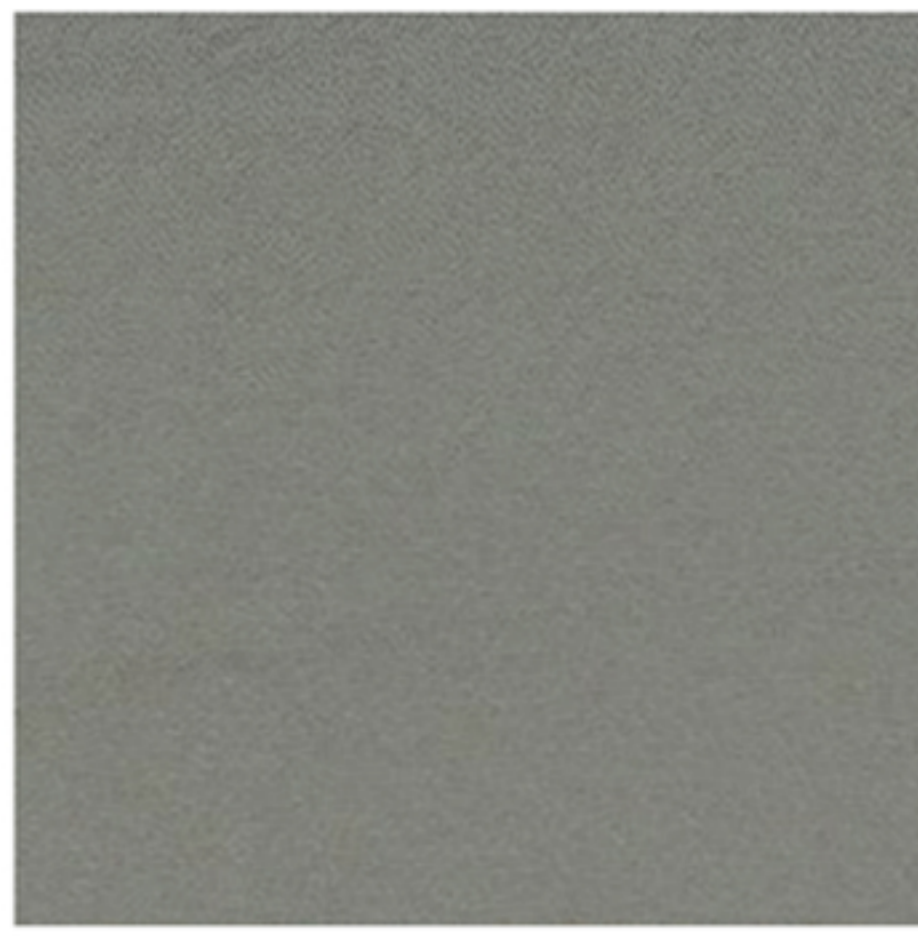
JACOB VERT DE GRIS Ref : 40980744