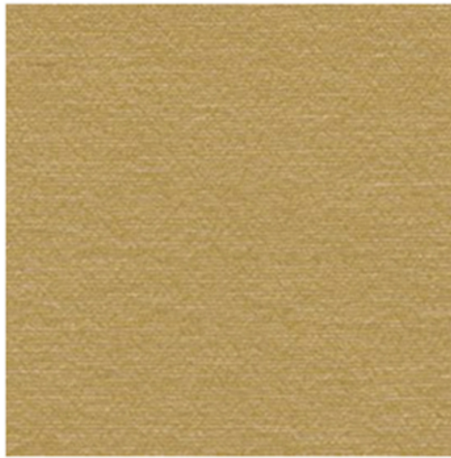
JACOB JAUNE OR Ref : 40980639