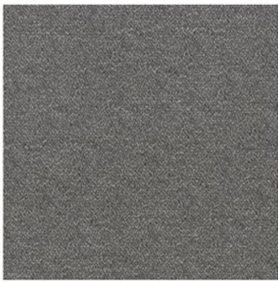
JACOB GRIS FUSAIN Ref : 40980429