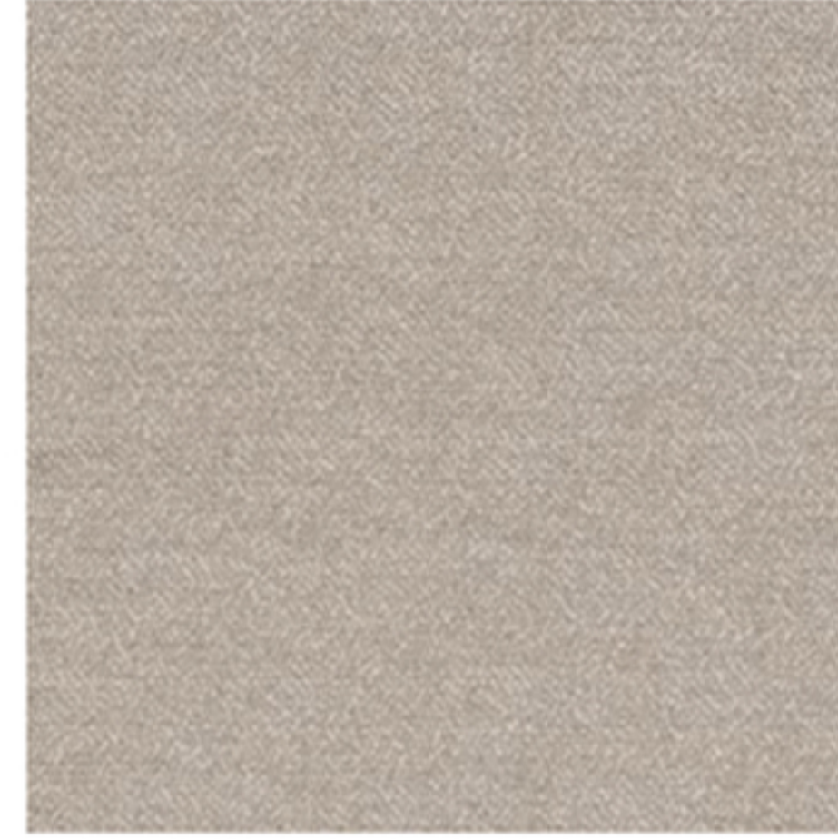
JACOB PRALINE Ref : 40980219