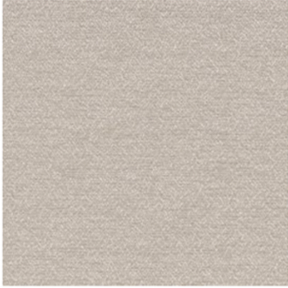
JACOB CRAIE Ref : 40980114