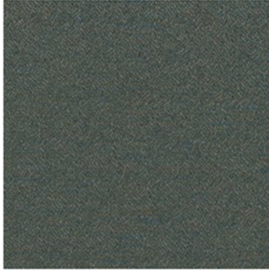
JACOB CARAIBE Ref : 40980849