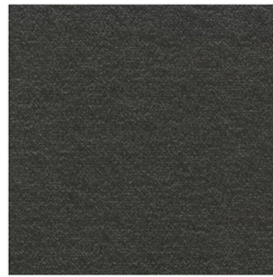
JACOB NOIR DE LUNE Ref : 40980534