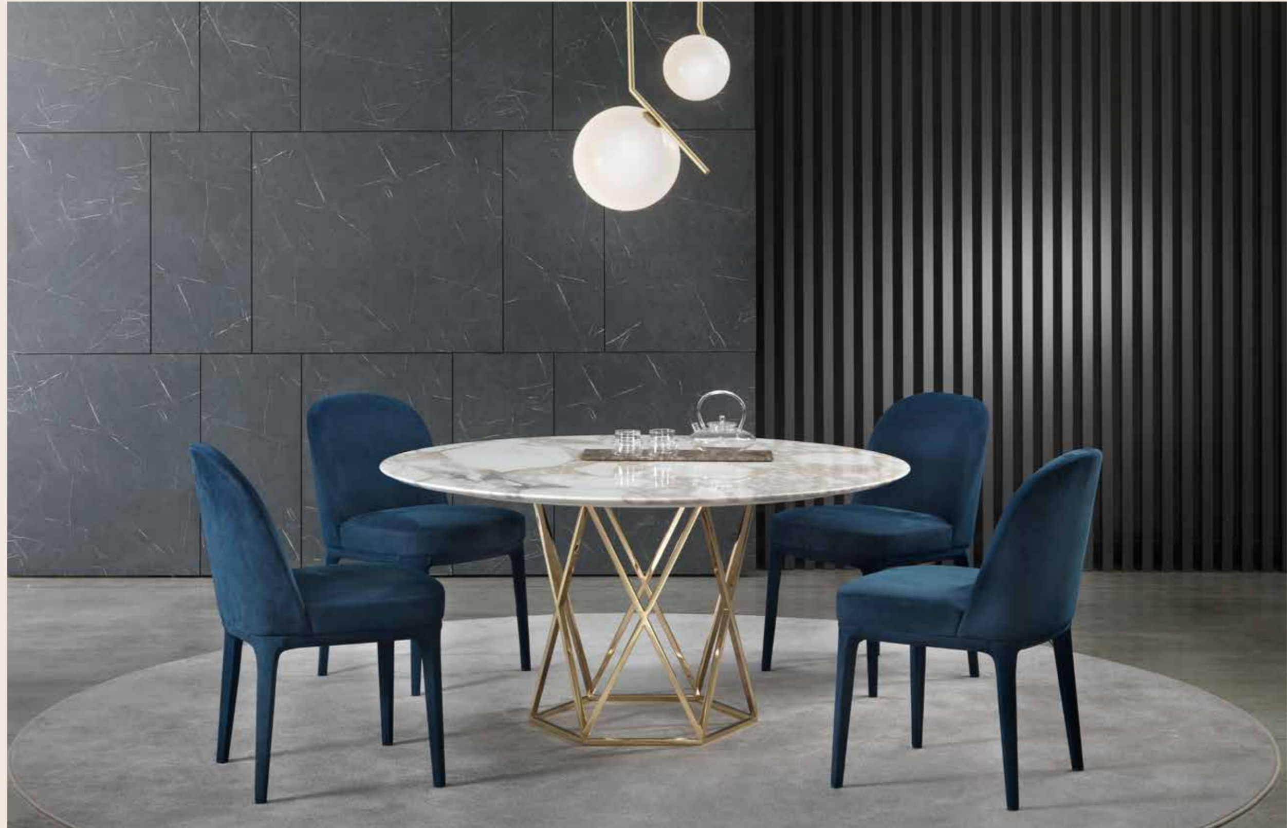
Tatlin Dining Table | Paris | Chia

TATLIN dining table 7TAT128 øcm150x74h Base: OPM11 gold pearl painted metal | Top: OPG3 Statuario Select Porcelain Stoneware CHIA chairs 9CHI104 cm58x53x77h Outside: Leather cat. Lusso art. Nabuk col. C/3436 bluette | Inside: Fabric cat. H art. Sahco Avalon col. 2194-001 blue