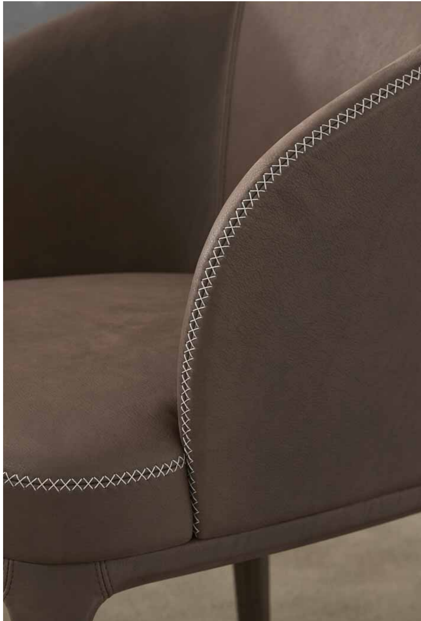
Detail of "X Stitching"