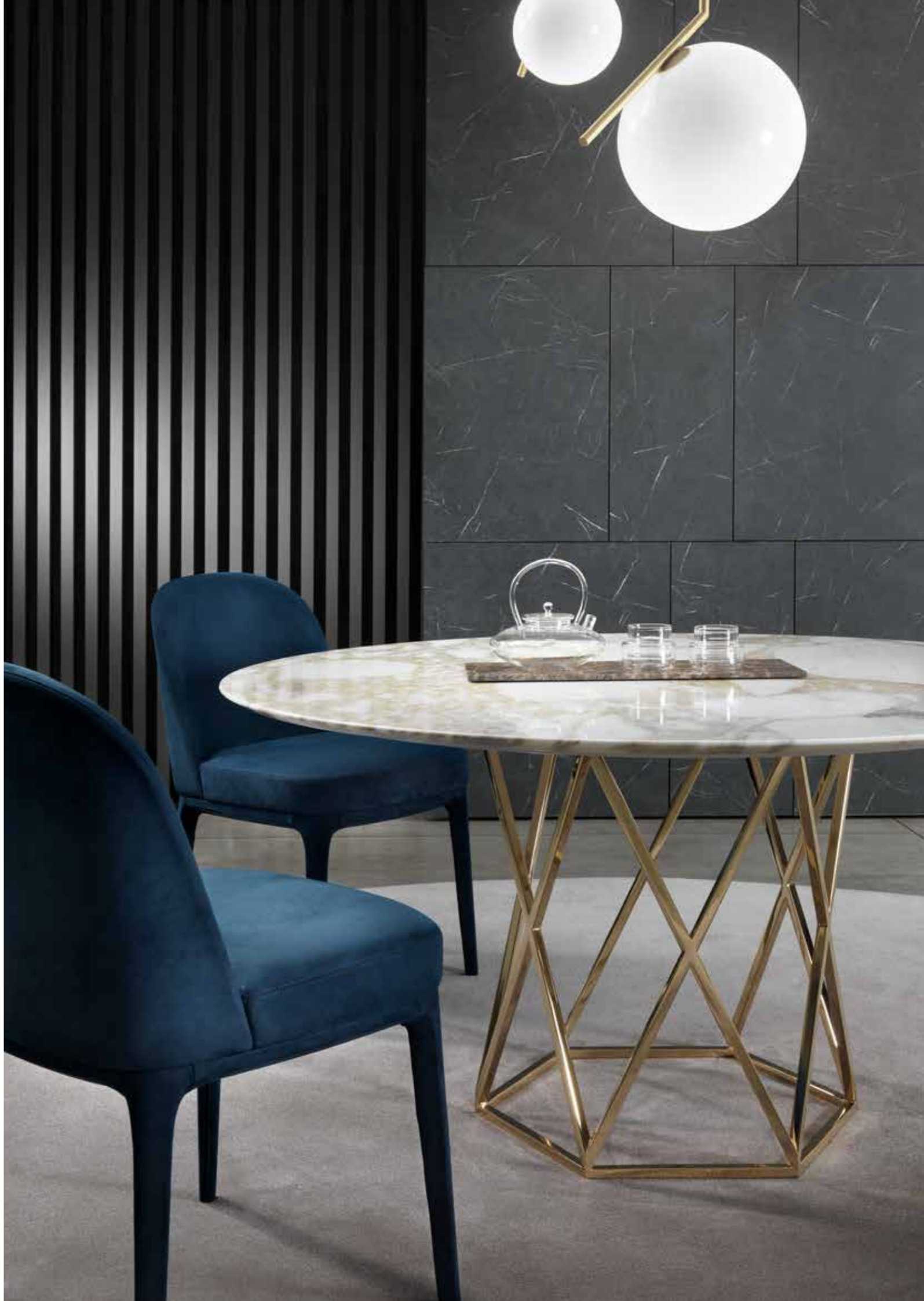
TATLIN dining table 7TAT128 øcm150x74h Base: OPM11 gold pearl painted metal | Top: OPG3 Statuario Select Porcelain Stoneware PARIS chairs 9PAR101X cm53x61x90h Leather: cat. Lusso art. Nabuk col. C/3436 Bluette Wooden base covered in the same leather