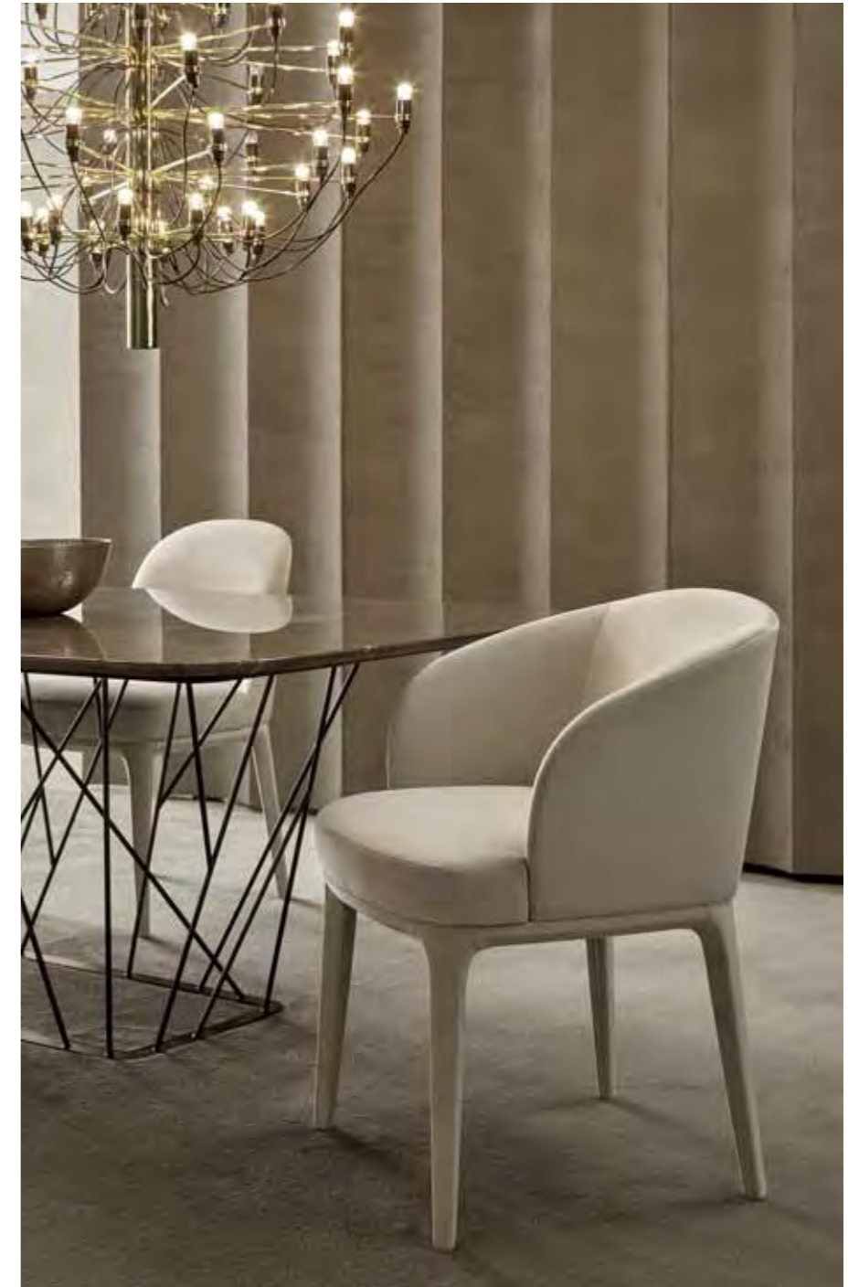
PARIS small armchair 9PAR103 cm 59x61x83h Fabric: cat. C art. Koala col. 100 Base covered in the same fabric