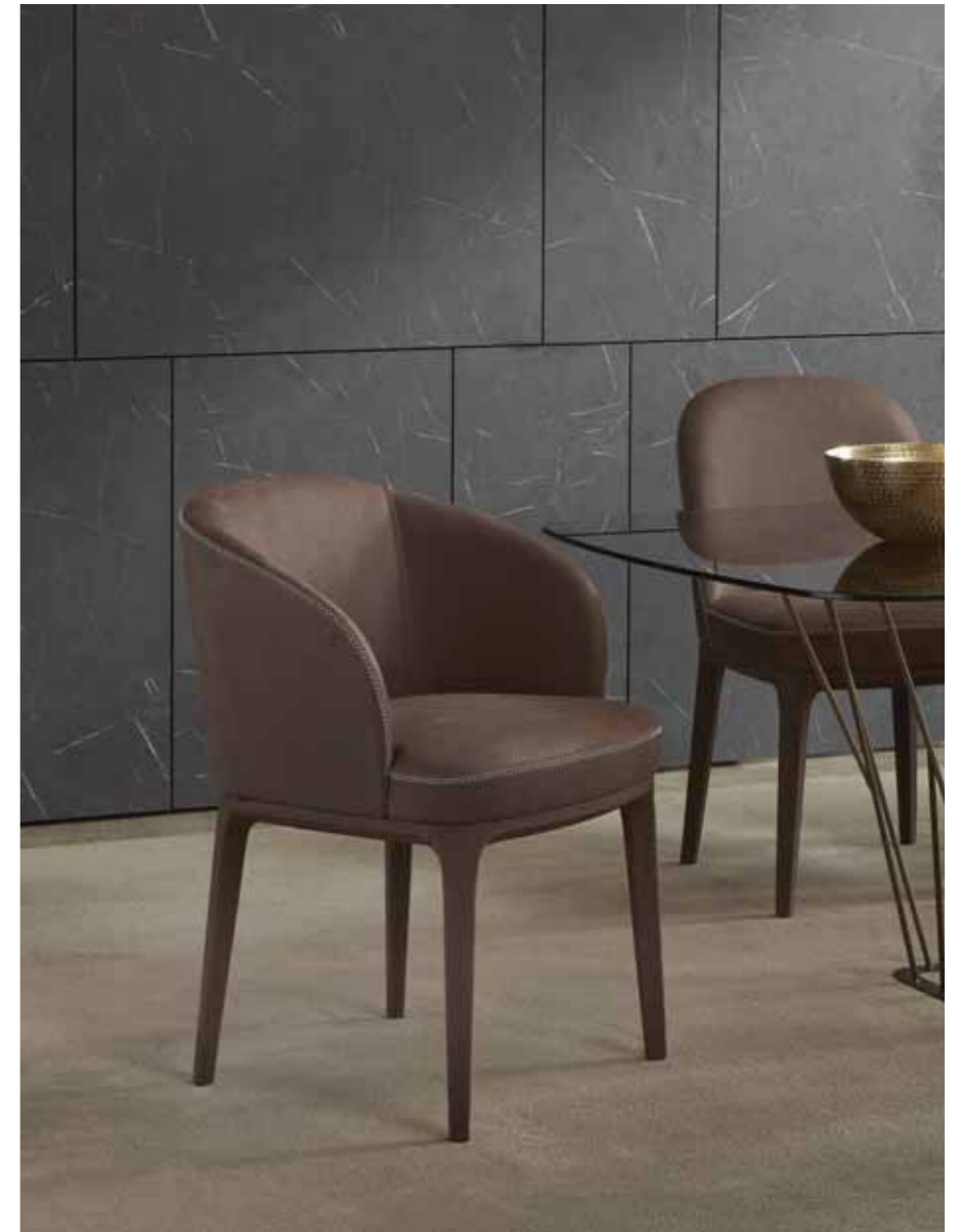
PARIS small armchair 9PAR103 cm 59x61x83h Leather: cat. Lusso art. Seta col. Ebano, with "X Stitching" Base: covered in the same leather