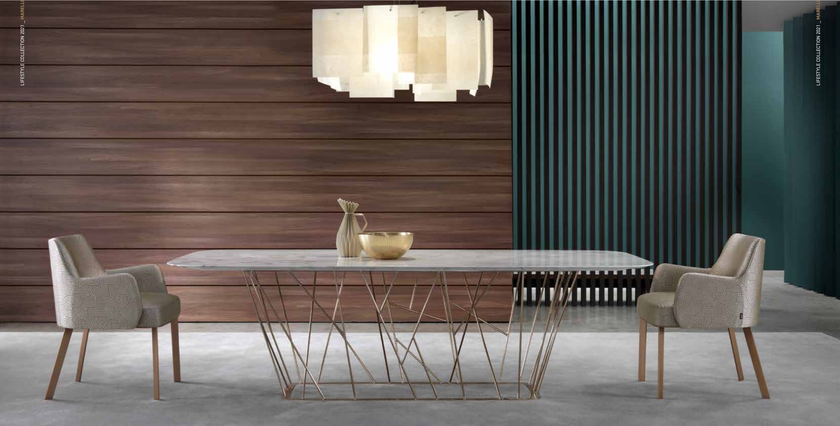
TWIG dining table 7TG136 cm300x120x74h Base: OPM15 antique gold brushed metal | Top: OPP7 Calacatta gold marble CLIPPER small armchairs 9CLX304 cm62x64x86h Fabric: cat. H art. Casamance Mollino 47180365 Tourterelle | Base: OPM15 antique gold brushed metal