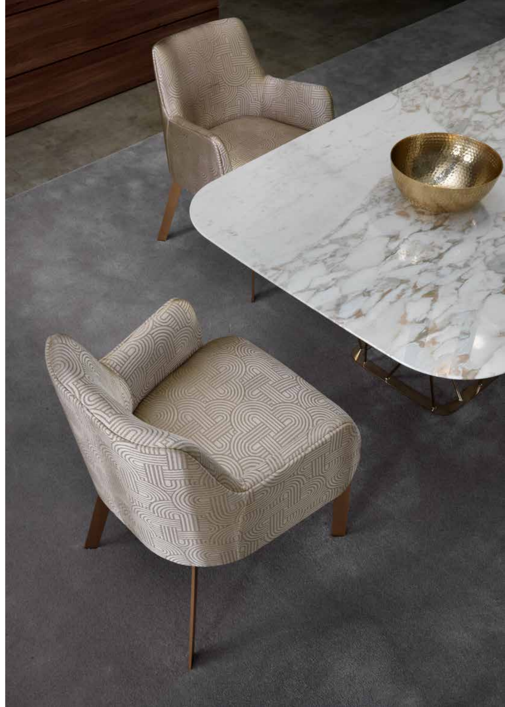
CLIPPER small armchair 9CLX304 cm62x64x86h Fabric: cat. H art. Casamance Mollino 47180365 Tourterelle | Base: OPM15 antique gold brushed metal