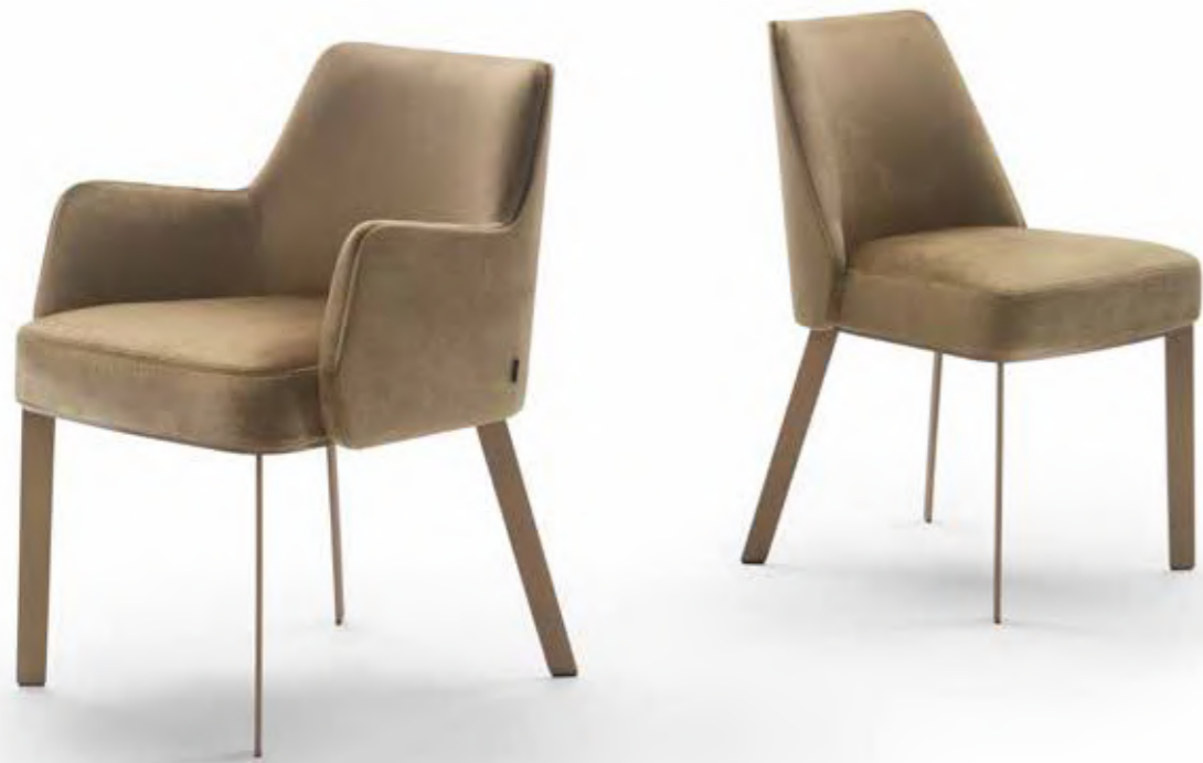
TWIG dining table 7TG136 cm300x120x74h Base: OPM15 antique gold brushed metal | Top: OPP7 Calacatta gold marble CLIPPER chair and small armchair 9CLX302 cm53x62x84h, 9CLX304 cm62x64x86h Fabric: cat. H art. Sahco Avalon 2 col. 021 | Base: OPM15 antique gold brushed metal