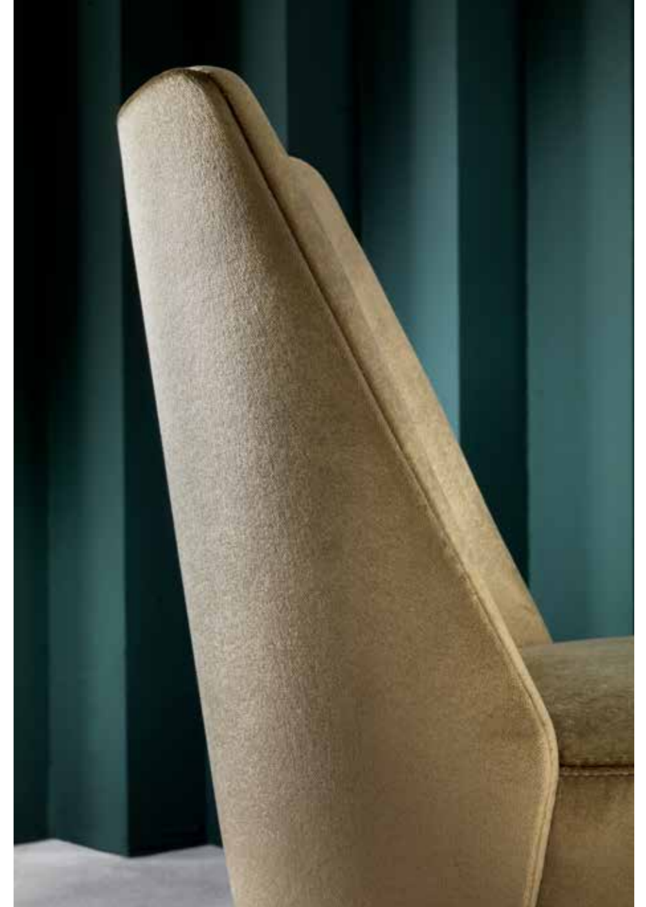
CLIPPER chair 9CLX304 cm62x64x86h Fabric: cat. H art. Sahco Avalon 2 col. 021 | Base: OPM15 antique gold brushed metal