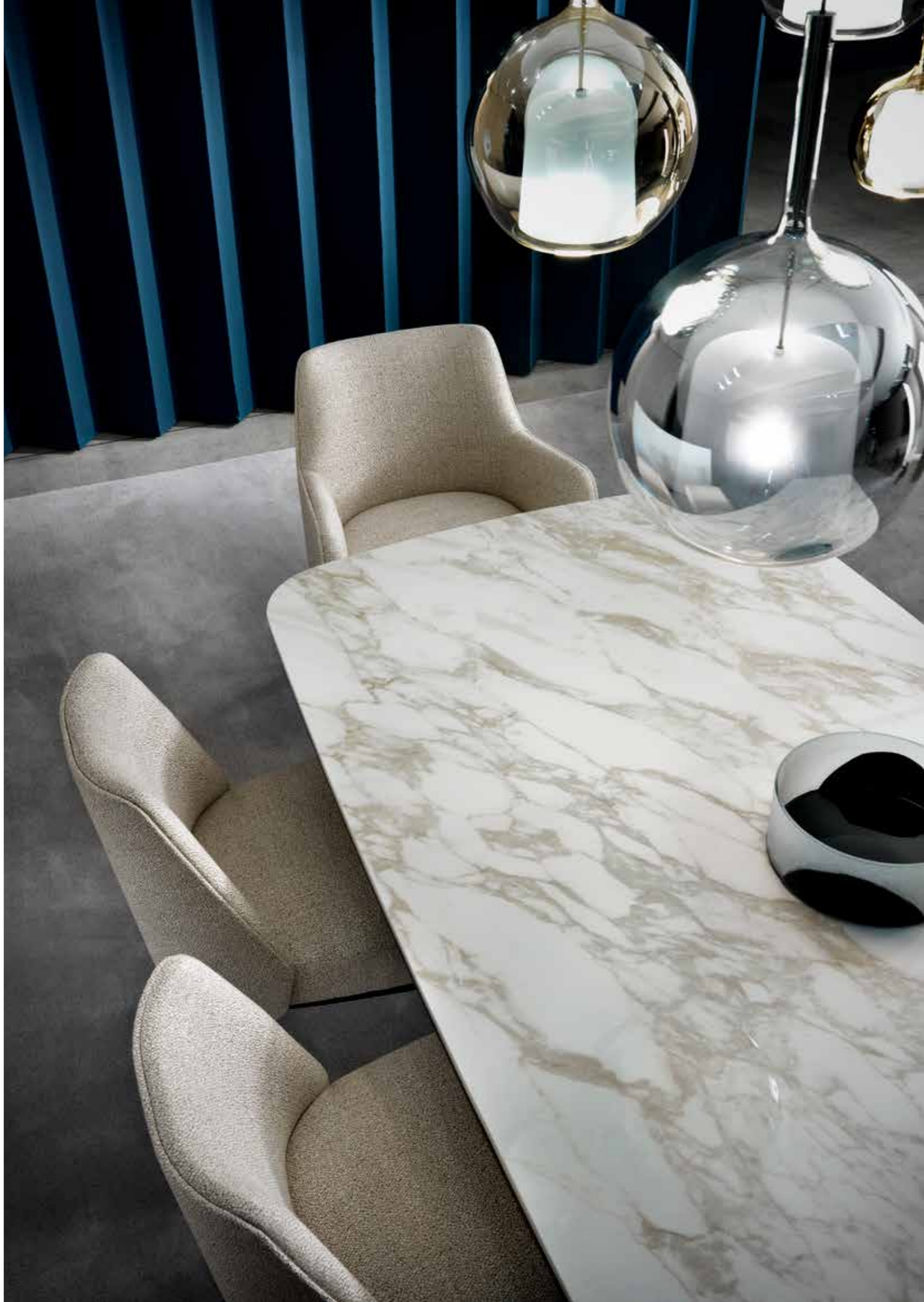
ANDERSON dining table 7AND101 cm255x110x71,5h Base: OPR15 moka matt stained oak | Top: OPG4 Calacatta Royal porcelain stoneware CLIPPER chairs and small armchairs 9CLX301 cm53x62x84h, 9CLX303 cm62x64x86h Fabric: cat. H art. Casamance Interview 3691/0541 | Base: OPR15 moka matt stained oak