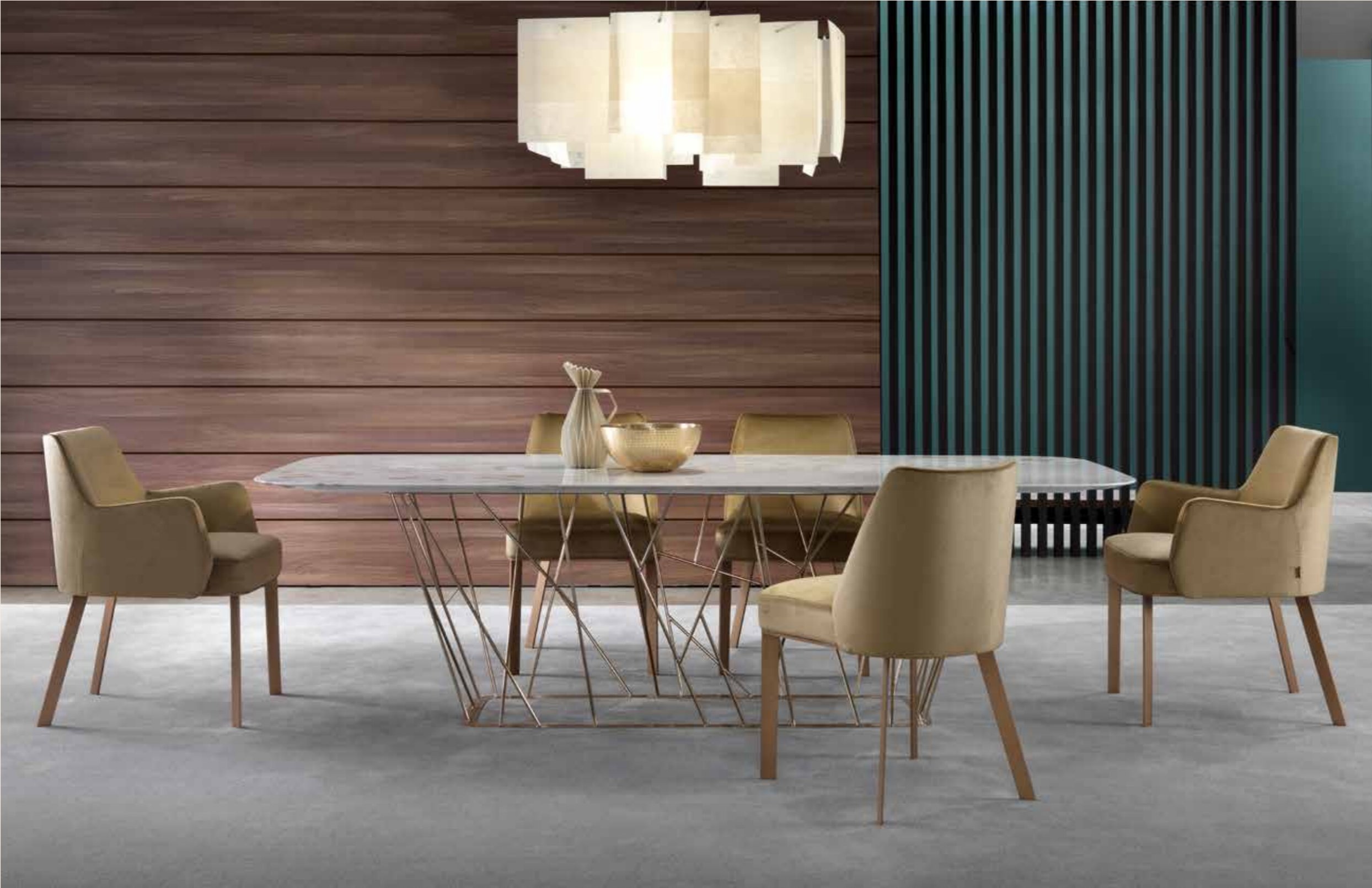
Clipper Chair | Twig Dining Table

TWIG dining table 7TG136 cm300x120x74h Base: OPM15 antique gold brushed metal | Top: OPP7 Calacatta gold marble CLIPPER chair and small armchair 9CLX302 cm53x62x84h, 9CLX304 cm62x64x86h Fabric: cat. H art. Sahco Avalon 2 col. 021 | Base: OPM15 antique gold brushed metal