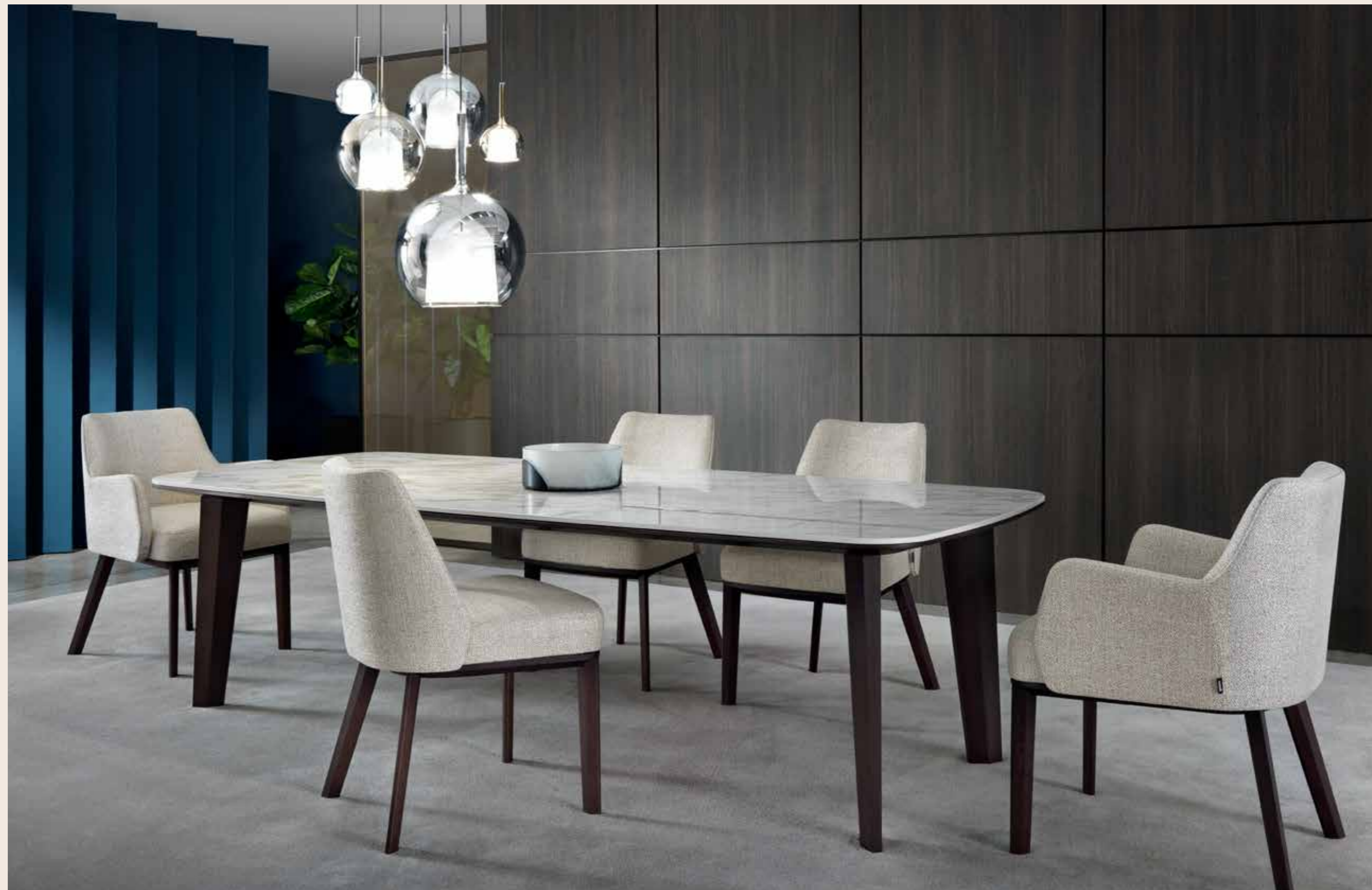
Anderson Dining Table | Clipper Chair

ANDERSON dining table 7AND101 cm255x110x71,5h Base: OPR15 moka matt stained oak | Top: OPG4 Calacatta Royal porcelain stoneware CLIPPER chairs and small armchairs 9CLX301 cm53x62x84h, 9CLX303 cm62x64x86h Fabric: cat. H art. Casamance Interview 3691/0541 | Base: OPR15 moka matt stained oak