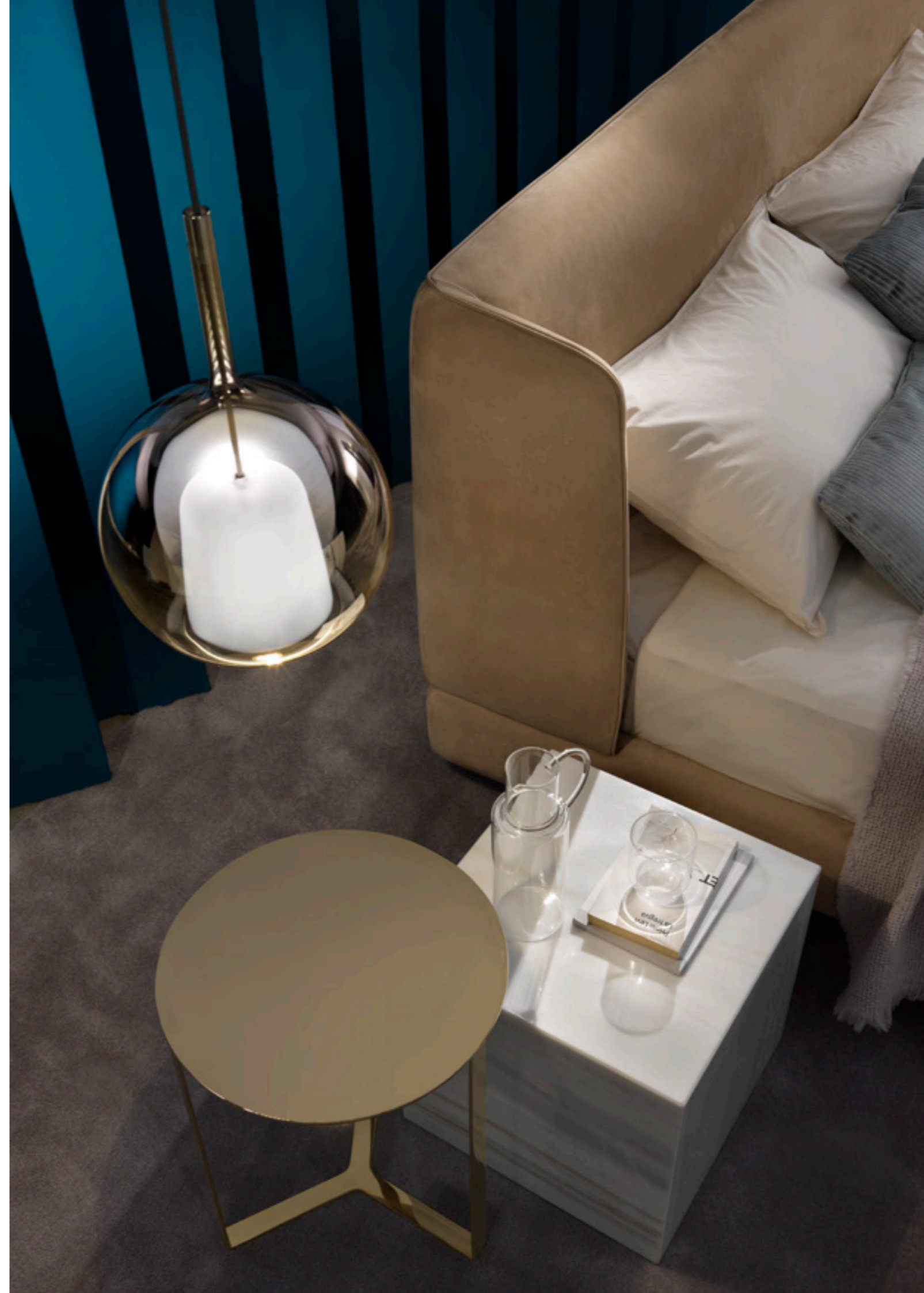
THOR side table 7TH103 cm 40x40x40h OPP15 Covelano white marble CLIP side tables 7CL118 ø cm 40x50h OPM16 shiny brass chrome metal