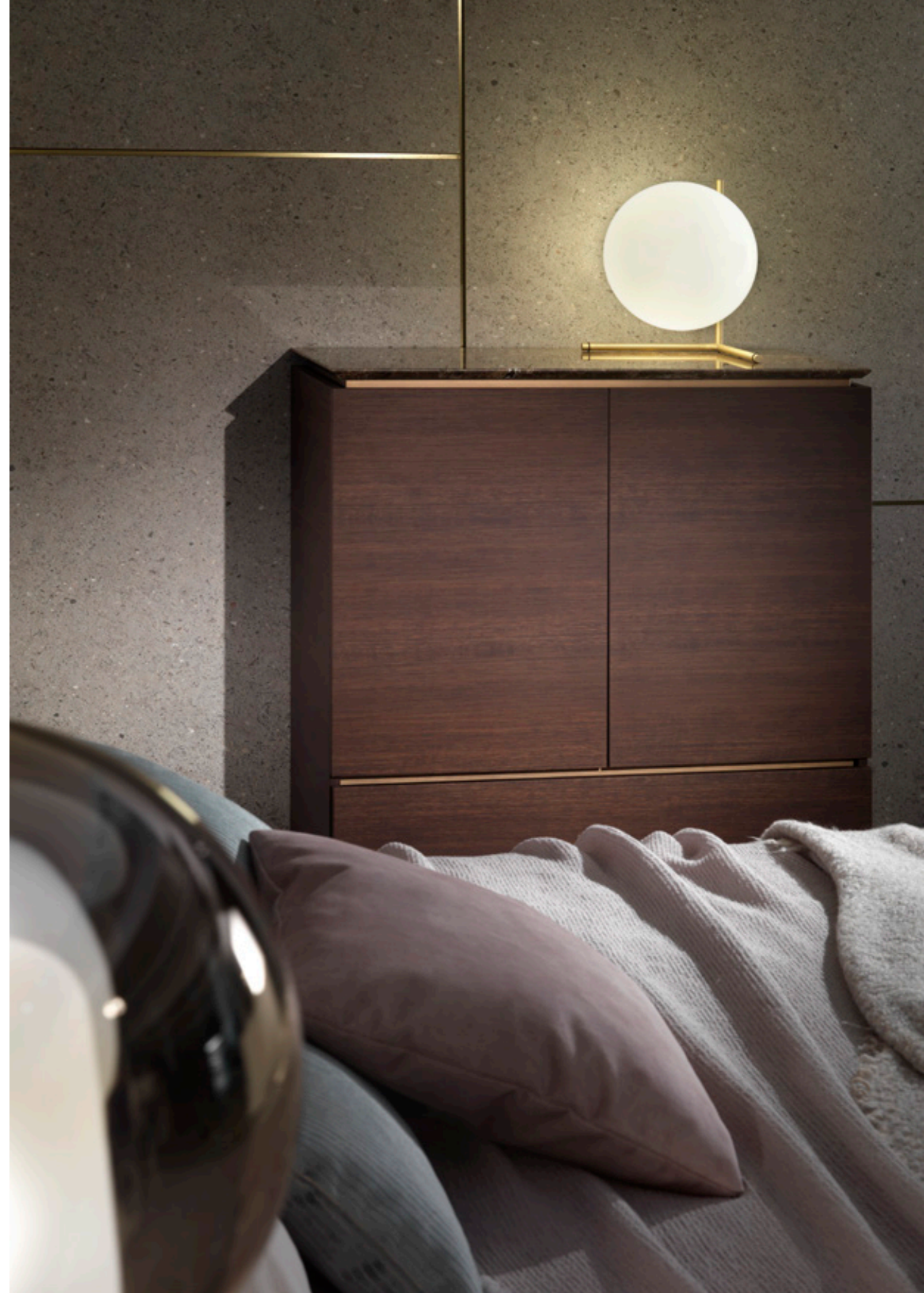
KYOTO cupboard 7KY210 cm 100x50x105h Wooden structure: OPR15 moka matt stained oak Marble top: OPP3 Emperador brown marble Metal: OPM15 antique gold brushed metal