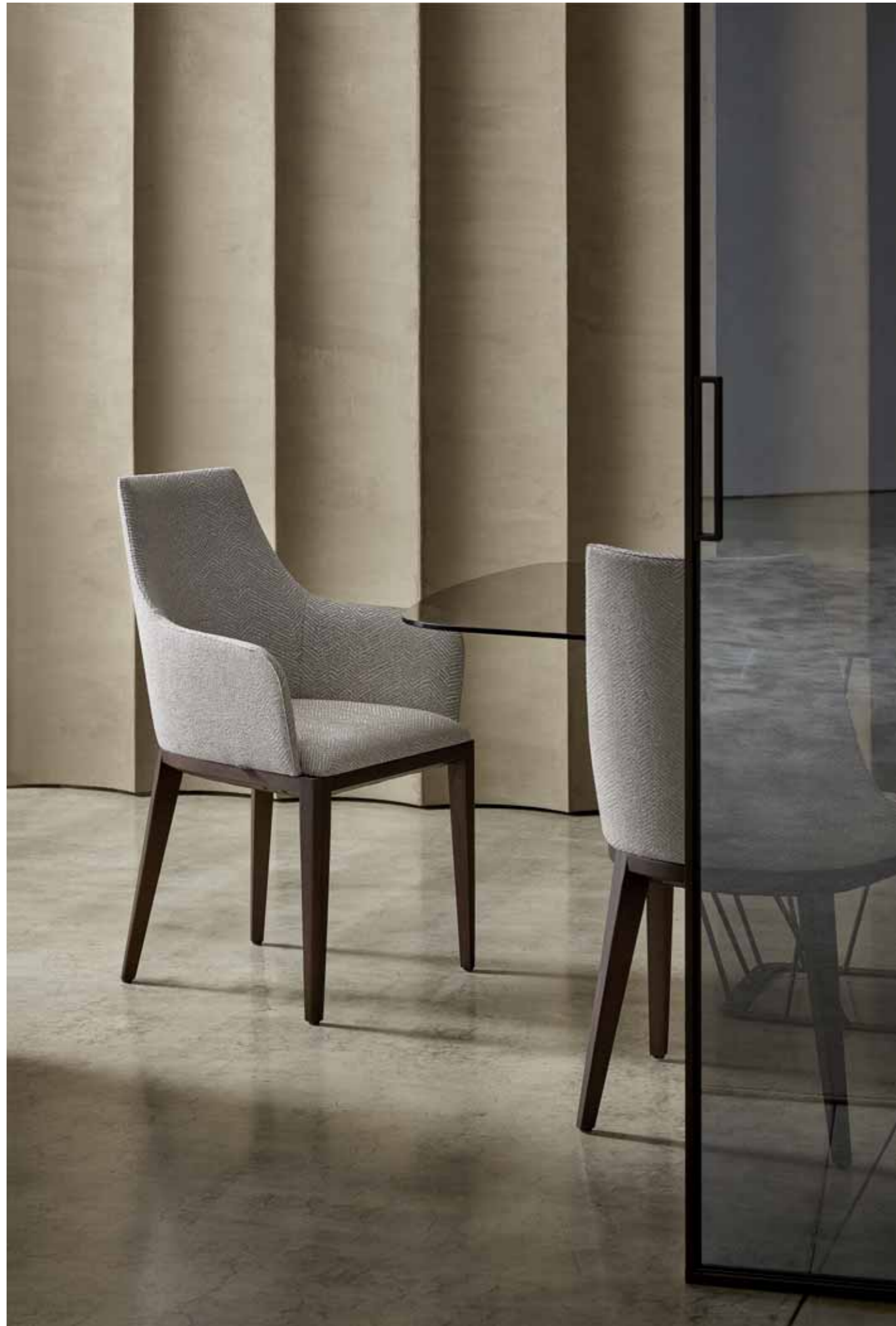
NICOLE chair with armrests 9NK103 cm 56x56x91h Fabric: cat. H art. Sahco Kent col. 003 Base: OPR15 moka matt stained oak