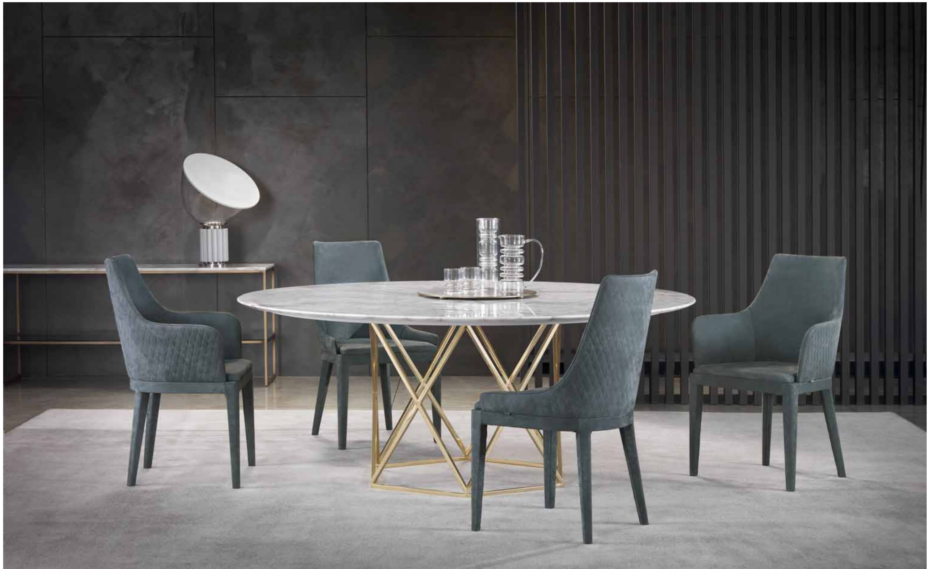
TATLIN dining table 7TAT125 ø cm 190x74h Base: OPM16 shiny brass chrome metal Top: OPP7 Calacatta gold marble