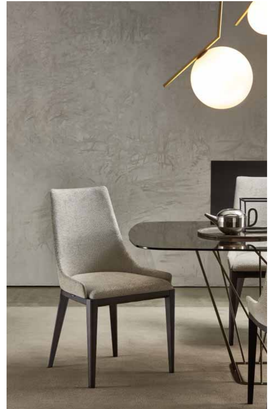
NICOLE chair 9NK101 cm 53x56x91h Fabric: cat. H art. Sahco Kent col. 003 Base: OPR15 moka matt stained oak