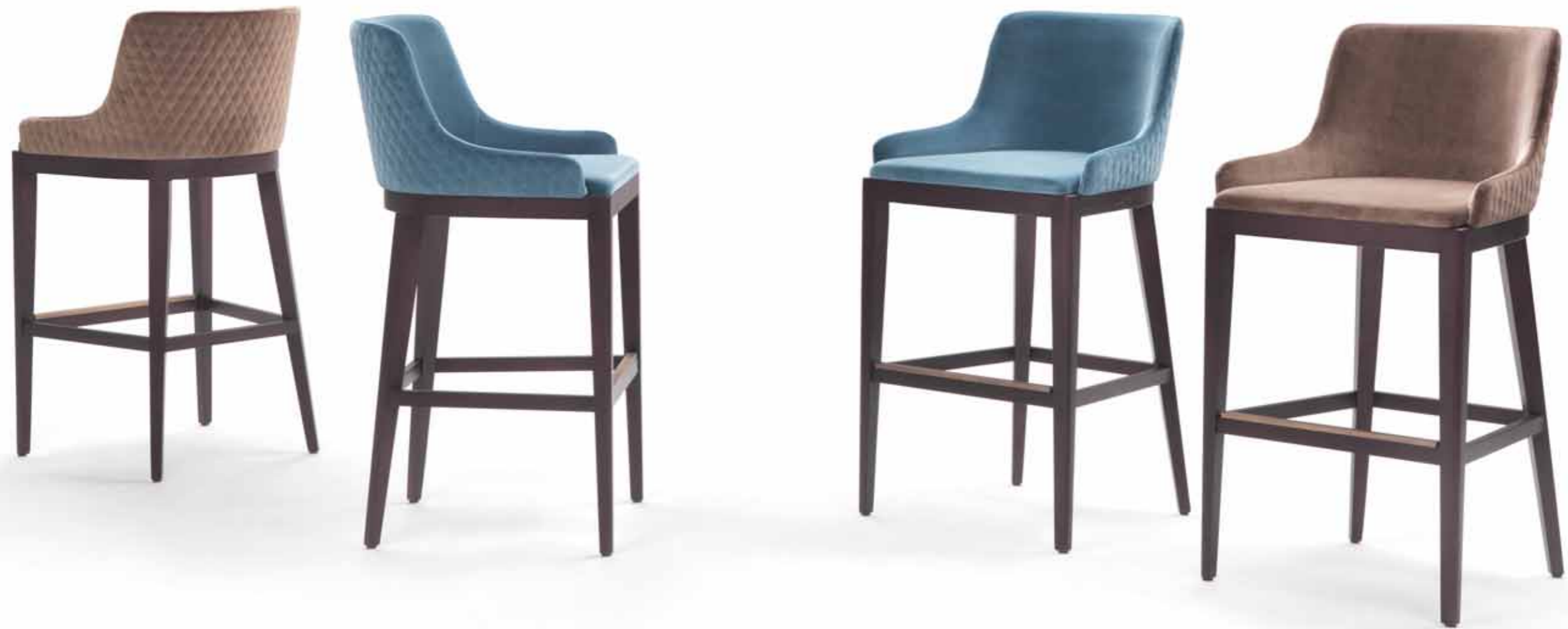
NICOLE bar stools 9NK114 cm 53x56x99h with quilted external backrest Fabric: cat. H art. Rubelli Spritz col. 23 acqua and 07 castagna Oak base: OPR2 wengè stained oak with OPM15 antique gold brushed metal profile