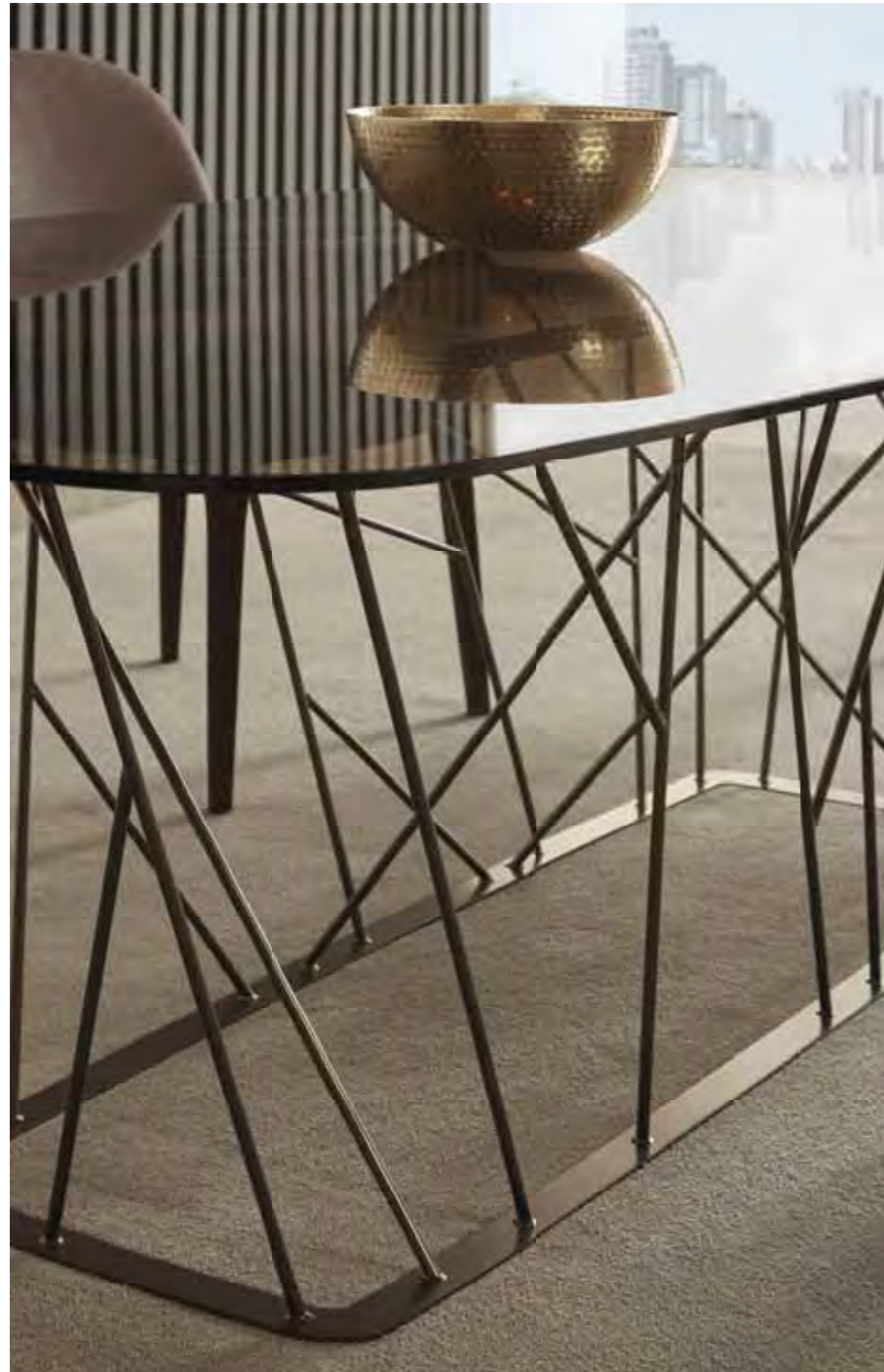
TWIG dining table 7TG138 cm 240x120x74h Base: OPM18 anodized bronze painted metal Top: OPV12 transparent bronze glass