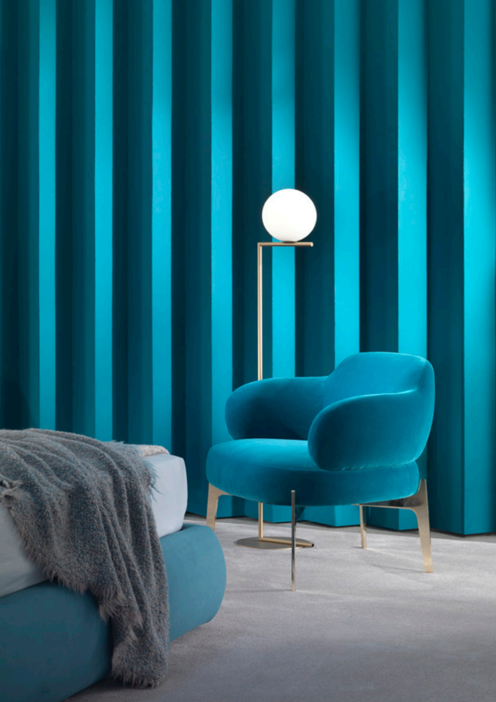
SIGN armchair 9SI112 cm 83x75x75h Fabric: cat. F/G art. Misia Aime col. M188 613 Seychelles Base: OPM16 shiny brass chrome metal