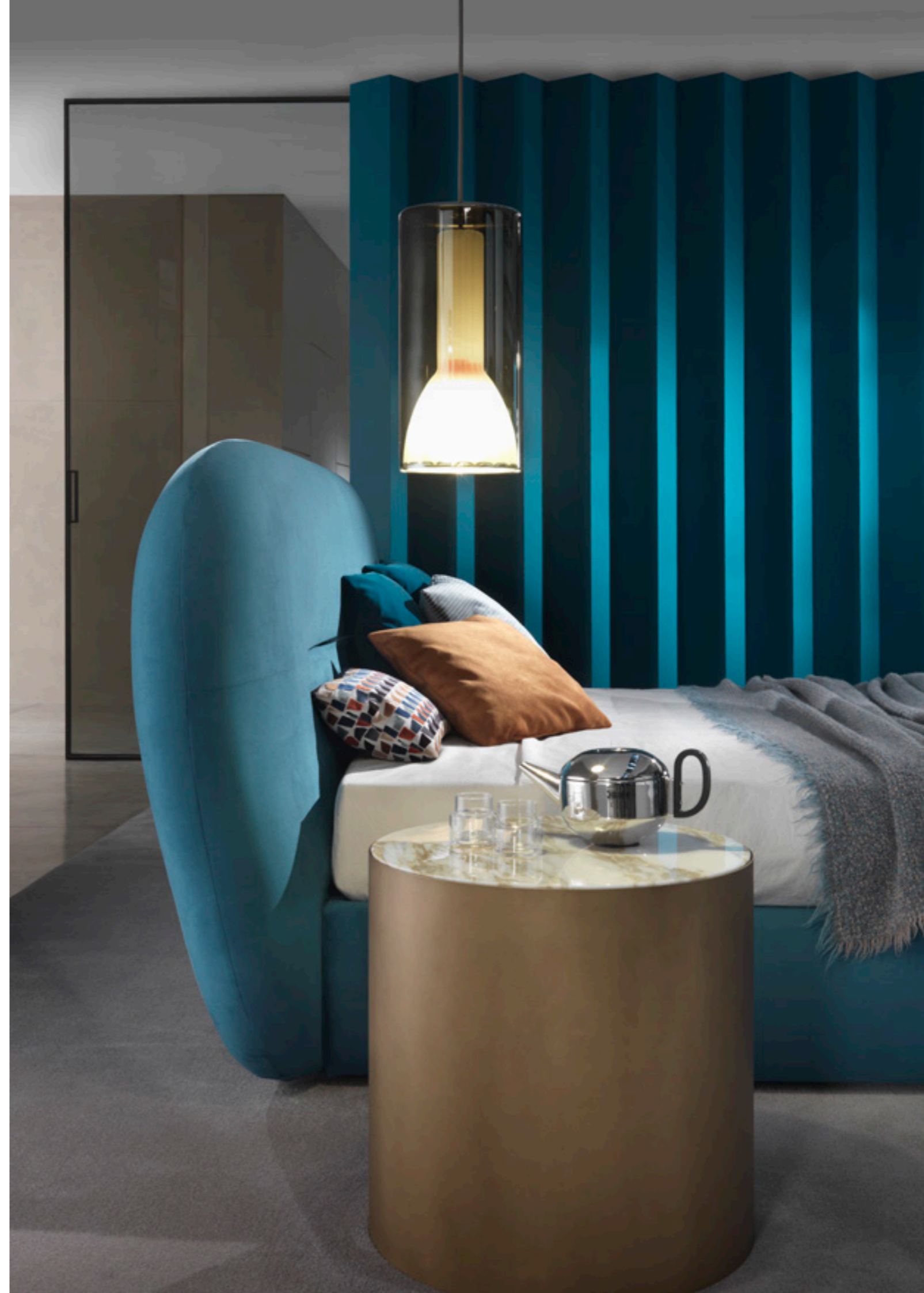
ARTHUR side table 7ART201 ø cm 50x50h Base: OPM20 Delabré brass brushed metal Top: OPP7 Calacatta marble