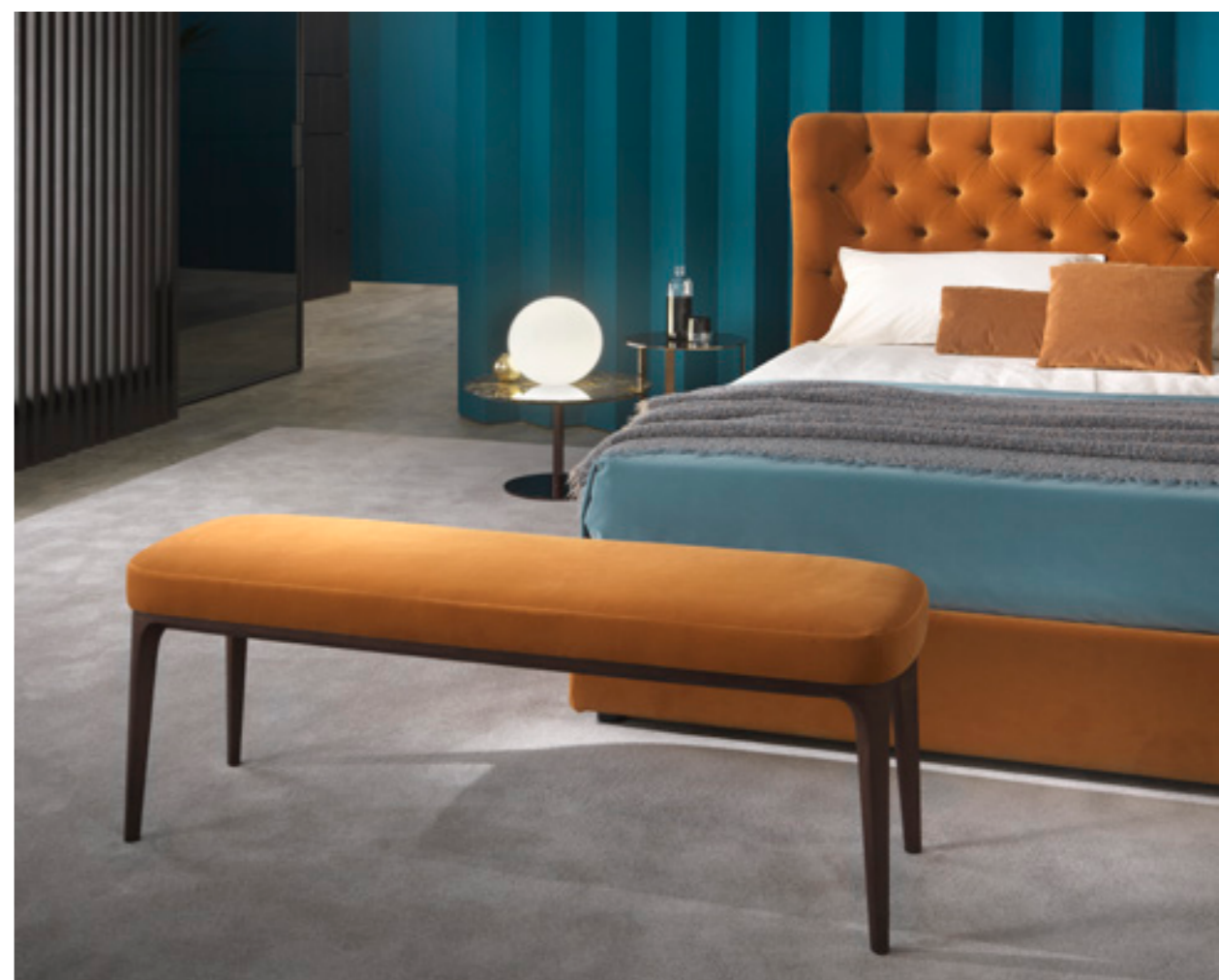
BRERA armchair with high back 9BRE105 cm 80x82x101h Fabric: cat. F/G art. Misia Aime M188 512 blue turquin Base: OPR15 moka matt stained oak PARIS bench 9PAR107 cm 130x40x50h Fabric: cat. F/G art. Misia Aime M188 622 Badiane Base: OPR15 moka matt stained oak