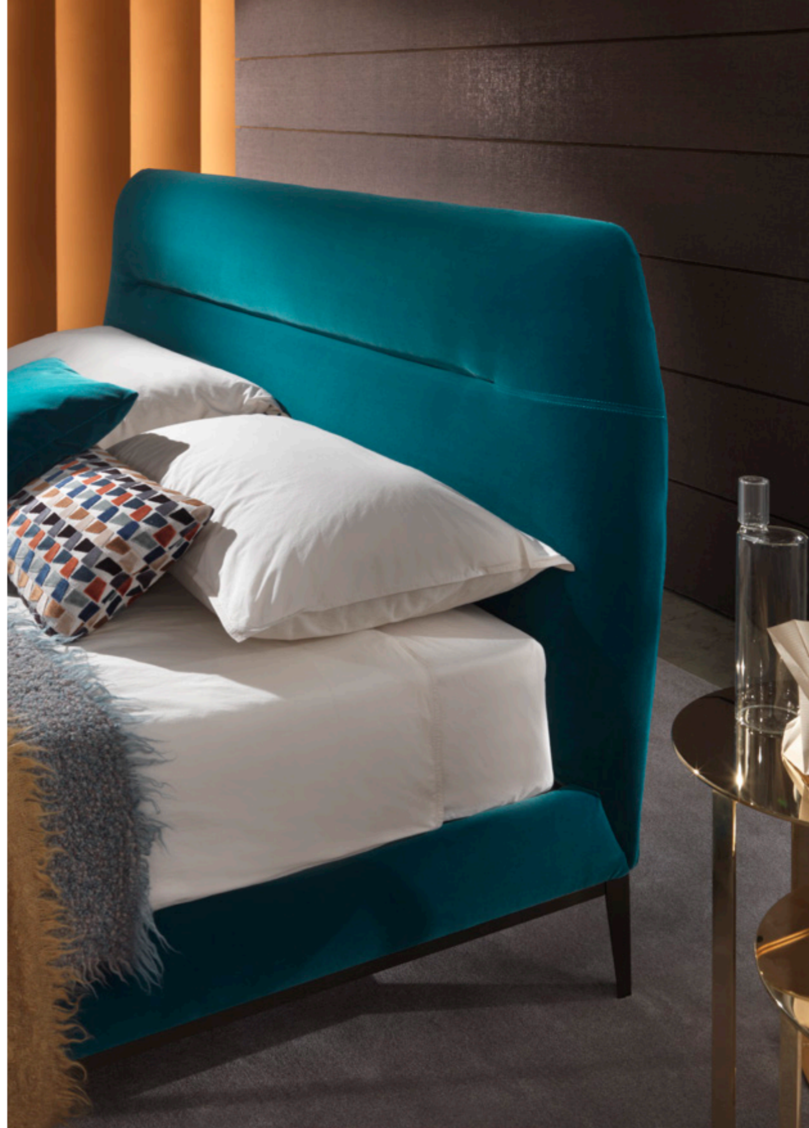
Detail of the RITZ bed headboard