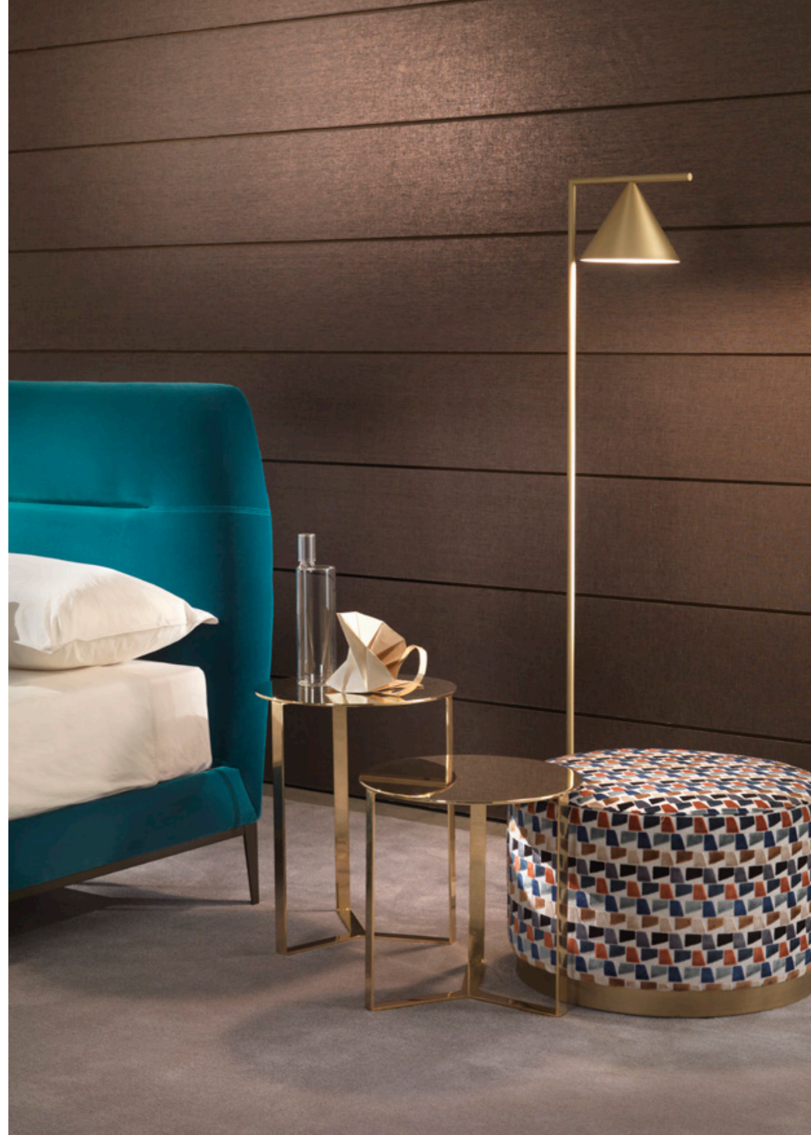
MOON ottoman 9MN102 \varnothing cm 60x40h Fabric: cat. H art. Casamance Paddington 485704 94 Base: OPM15 antique gold brushed metal CLIP side tables 7CL117 \varnothing cm 40x40h | 7CL118 \varnothing cm 40x50h OPM16 shiny brass chrome metal