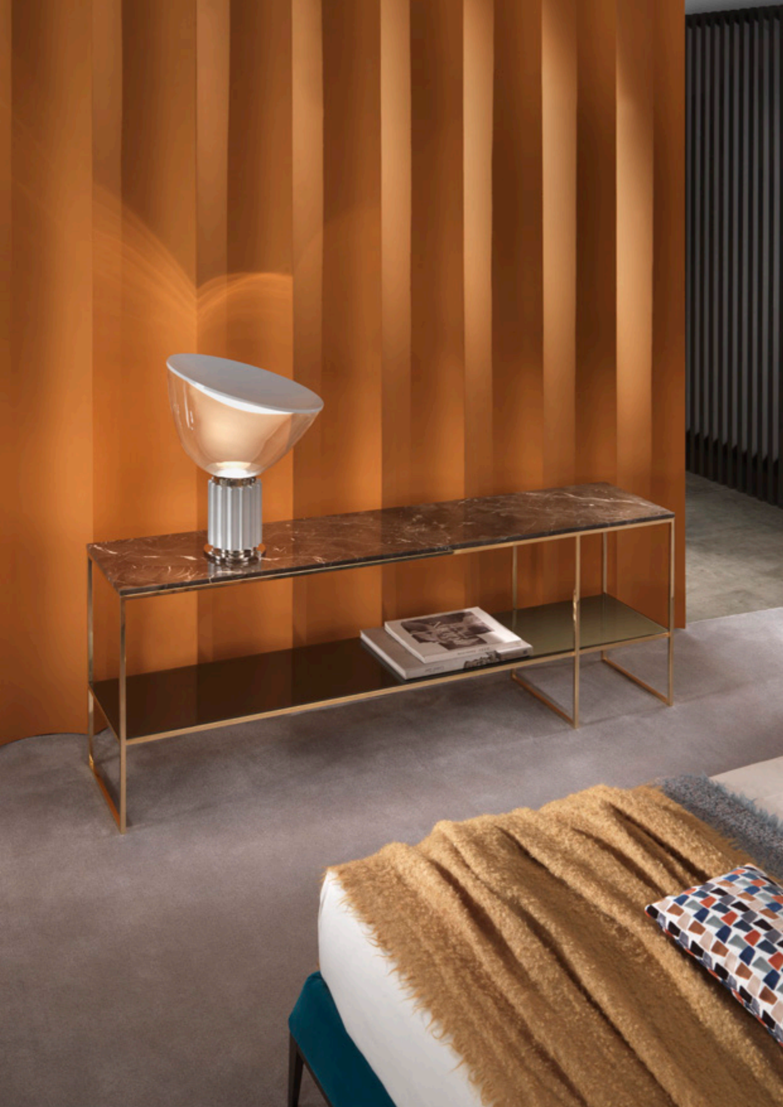
FRAME console 7FR130 cm 200x40x70h Structure: OPM16 shiny brass chrome metal Upper top: OPP13 Velvet brown marble Lower top: OPV9 chrome back-painted bronze metal