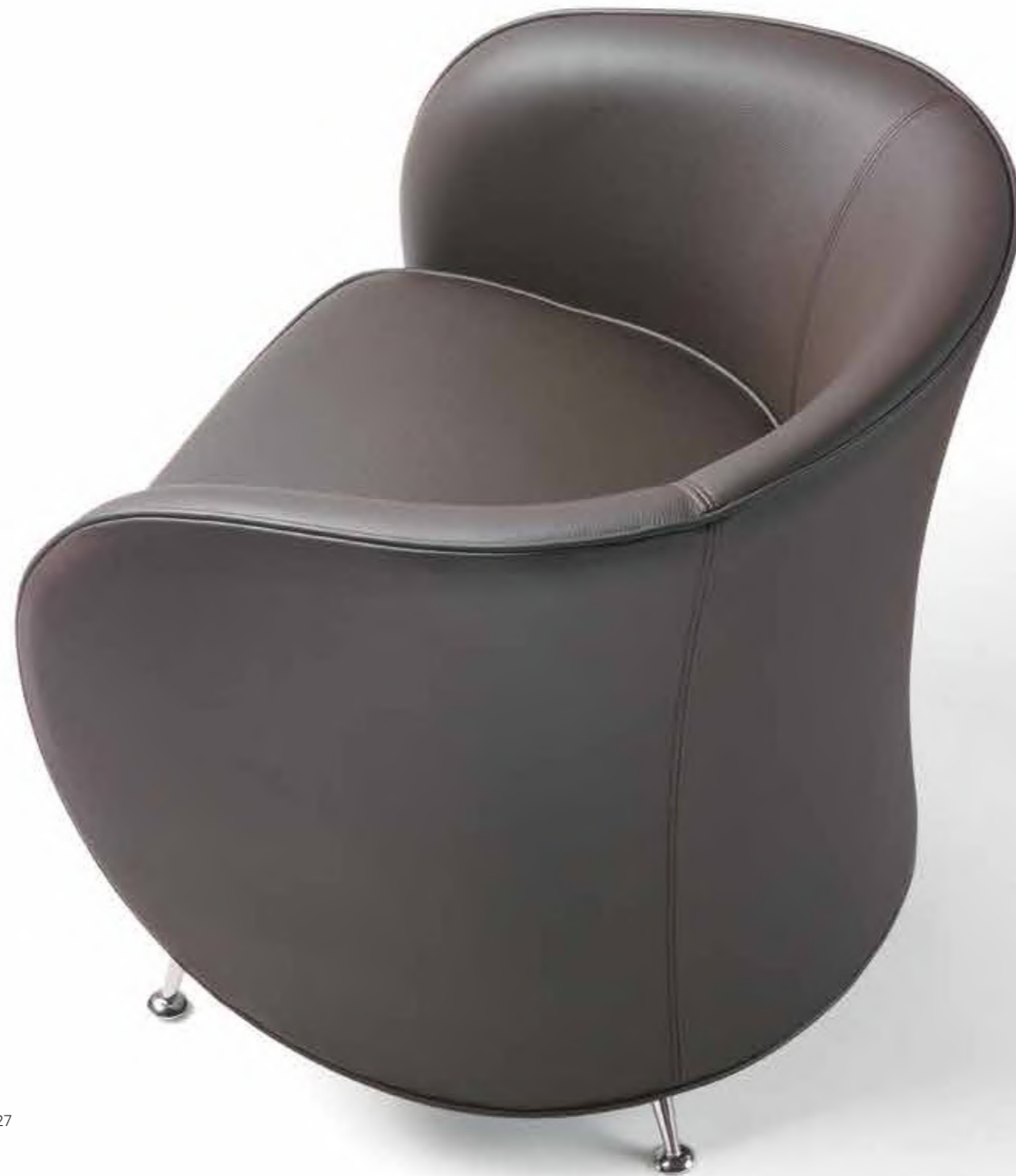
WELL_ ARMCHAIR 9WX101 CM 70X70X80H LEATHER: CAT. SUPER ART. 7070 FEET: OPM1 SHINY CHROME METAL 9WX101 CM 70X70X80H BACKREST: FABRIC CAT. H ART. KVADRAT HALLINGDAL COL. 227 SEAT: LEATHER CAT. SUPER ART. DOLLARO 7748 FEET: OPM1 SHINY CHROME METAL