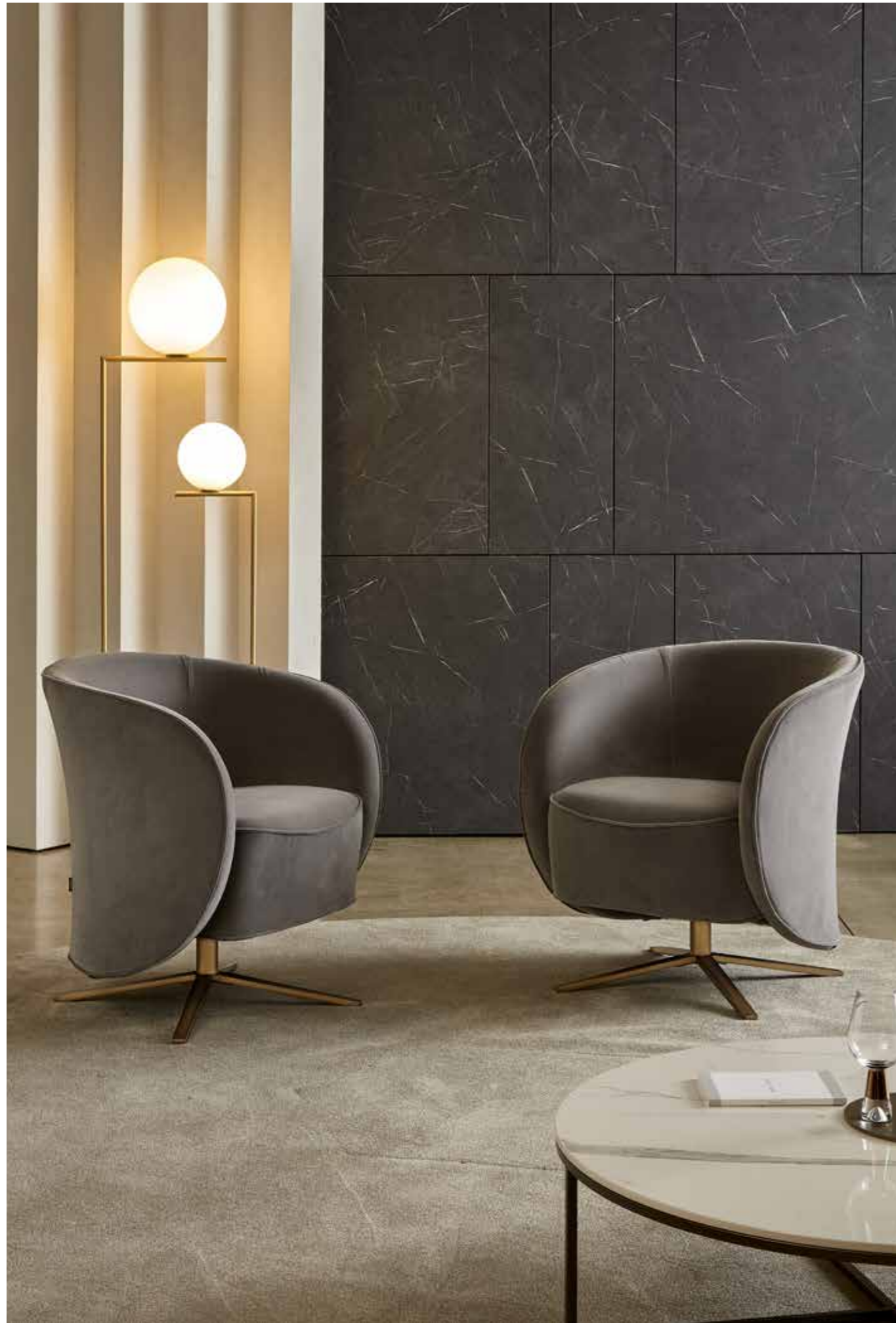
WELL _ SWIVEL ARMCHAIRS 9WX102 CM 70X70X80H FABRIC: CAT. F/G ART. MISIA AIME M 188 310 ARDOISE BASE: OPM15 ANTIQUE GOLD BRUSHED METAL