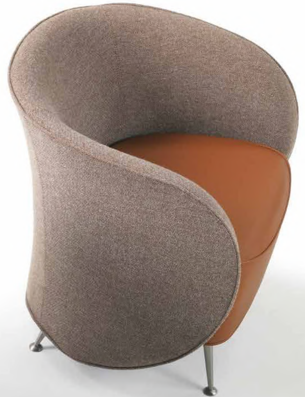
WELL_ ARMCHAIR 9WX101 CM 70X70X80H LEATHER: CAT. SUPER ART. 7070 FEET: OPM1 SHINY CHROME METAL 9WX101 CM 70X70X80H BACKREST: FABRIC CAT. H ART. KVADRAT HALLINGDAL COL. 227 SEAT: LEATHER CAT. SUPER ART. DOLLARO 7748 FEET: OPM1 SHINY CHROME METAL