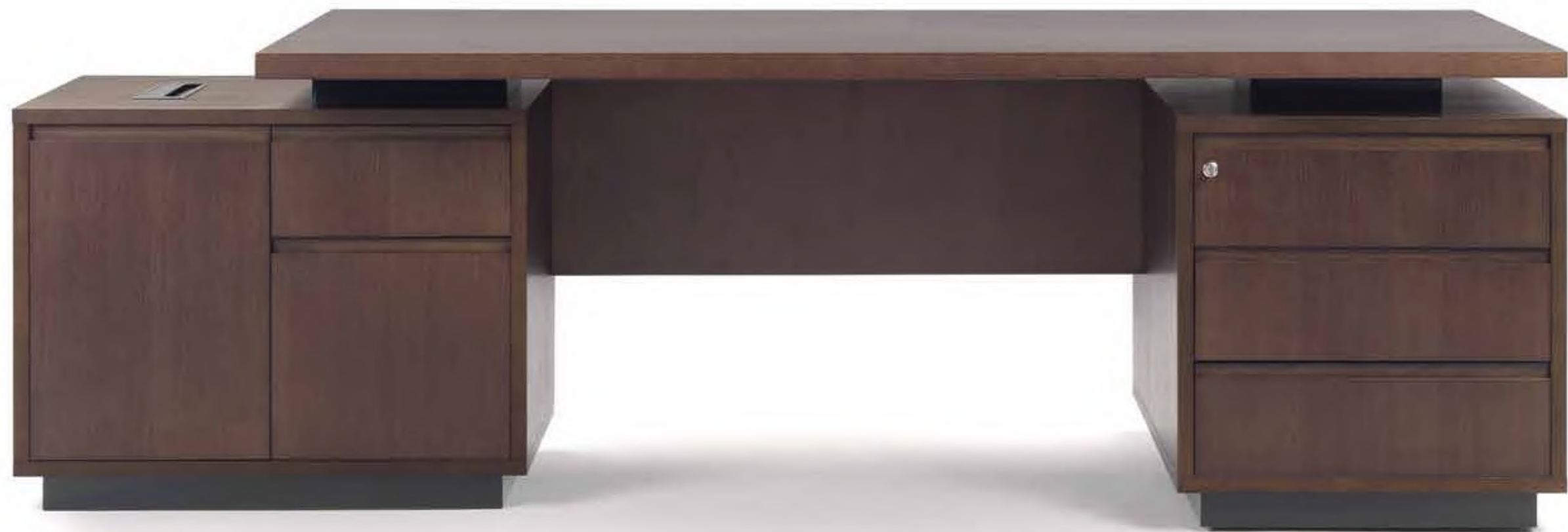
ASTON _ DESK 7AST101 CM 240X100X74H STRUCTURE: OPR11 CHARCOAL STAINED OAK BASE: OPM6 RAL 9017 TRAFFIC BLACK PAINTED METAL CABLE ACCESS: OPM6 RAL 9017 TRAFFIC BLACK PAINTED METAL