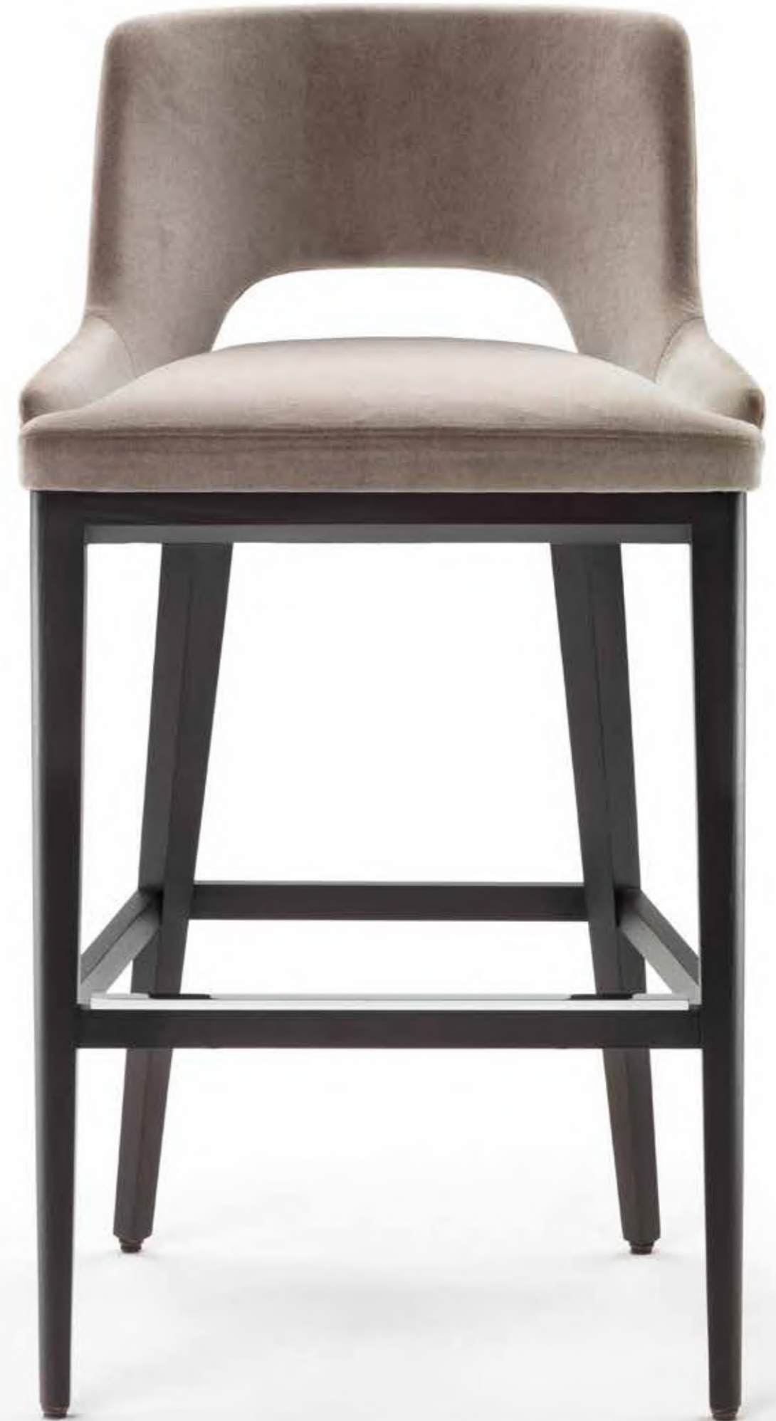
GRACE _ BAR STOOLS 9GR103 CM 56X56X101H FABRIC: CAT. H ART. RUBELLI SPRITZ COL. 12 TORTORA BASE: OPR2 WENGÈ STAINED OAK WITH OPM1 SHINY CHROME METAL PROFILE