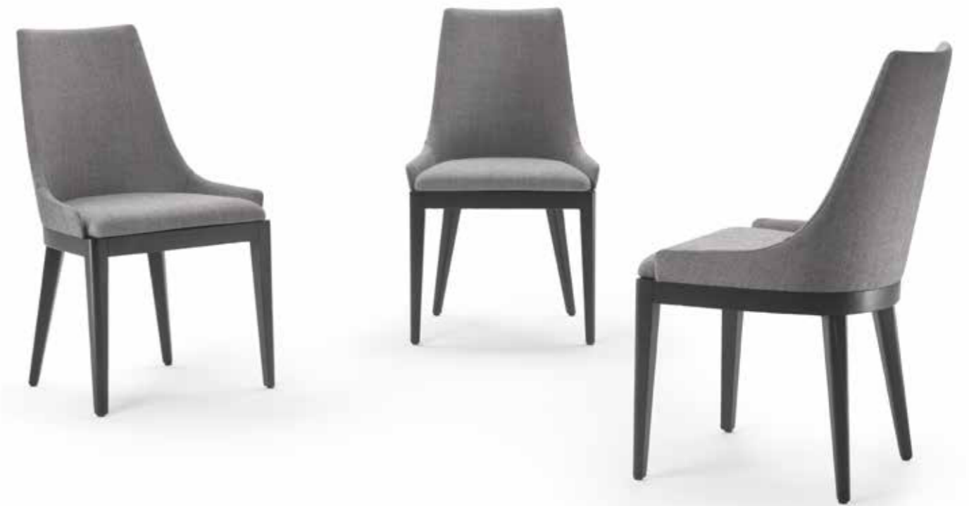
NICOLE _BARSTOOLS 9NK104 CM 53X56X99H METAL DETAIL: OPM1 SHINY CHROME NICOLE _CHAIRS 9NK101 CM 53X56X91H FABRIC: CAT. H ART. KVADRAT HALLINGDAL COL. 166 OAK BASE: OPR5 BLACK STAINED OAK