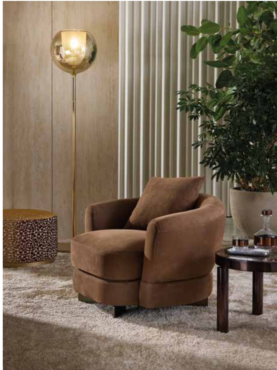
JEFF armchair 9JE101 cm 100x87x66h Leather: cat. Lusso art. Nabuk C/3407 mogano Base: OPM18 anodyc bronze painted metal Extra cushion: 1 x 9CU108 cm 55x55 Leather: cat. Lusso art. Nabuk C/3407 mogano