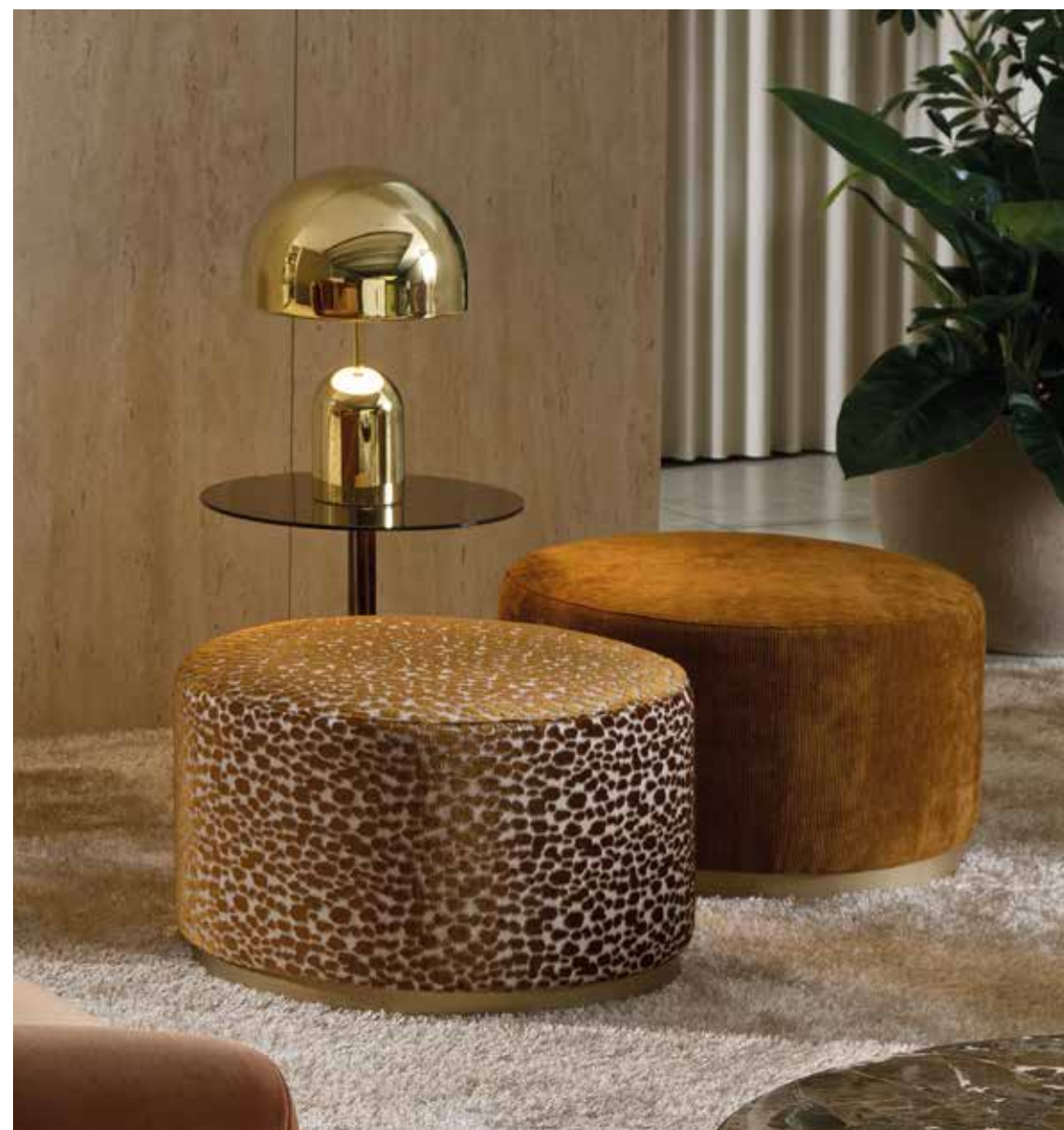
MOON ottomans 9MN102 ø cm 60x40h Fabrics: Misia Niki M347 501 mordoré Casamance Ferveur 4612 1179 Base: OPM15 antique gold brushed metal