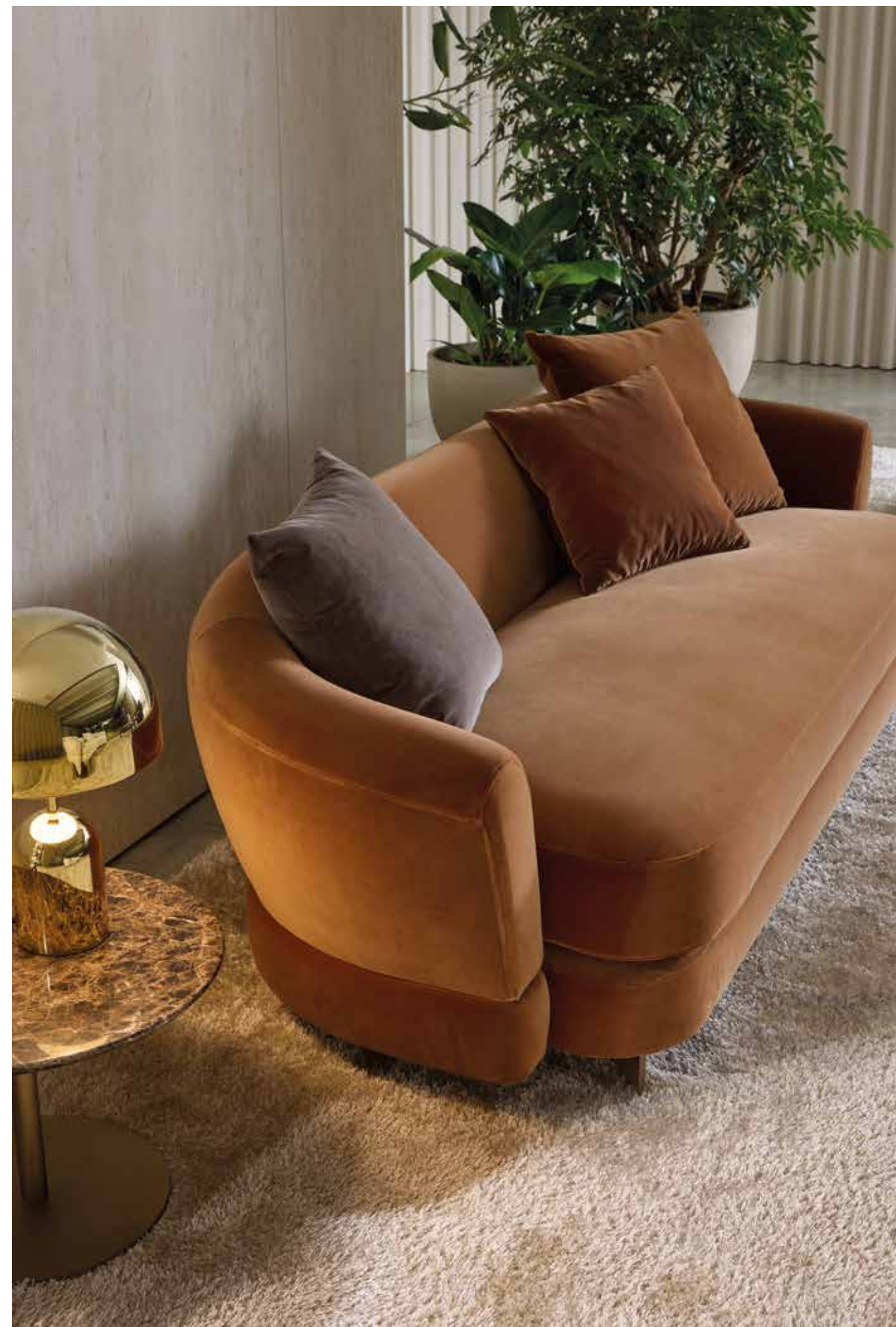
BREAK side table 7BR117 ø 40x45h Base: OPM17 bronze metal Top: OPV12 transparent bronze glass