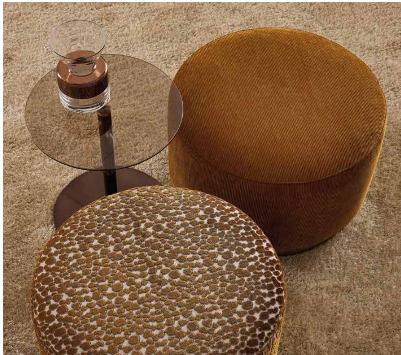
MOON ottomans 9MN102 ø cm 60x40h Fabrics: Misia Niki M347 501 mordoré Casamance Ferveur 4612 1179 Base: OPM15 antique gold brushed metal