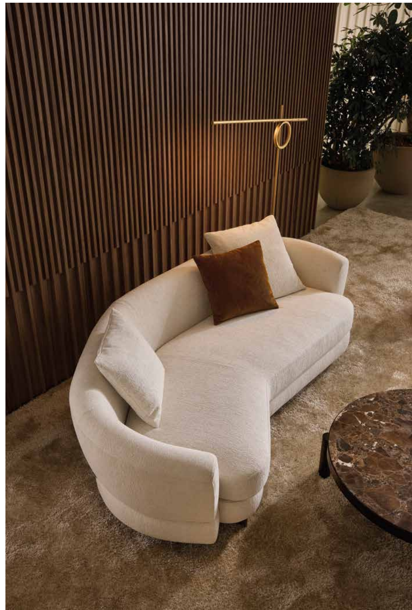
Extra cushions: 2 x 9CU108 cm 55x55 1 x 9CU106 cm 45x45 Fabric: cat. D/E art. Clusone 08