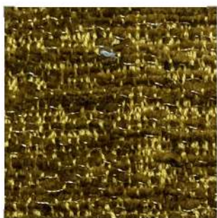
OCRA 30085-010 VELLO D'ORO