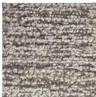
ARGILLA 30085-008 VELLO D'ORO