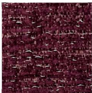
AMETISTA 30085-013 VELLO D'ORO