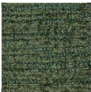
RESEDA 30085-017 VELLO D'ORO