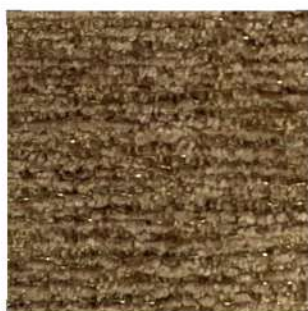
SIENA 30085-005 VELLO D'ORO