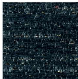
PAVONE 30085-015 VELLO D'ORO