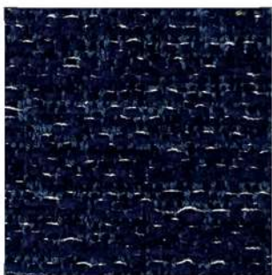
BLU 30085-014 VELLO D'ORO