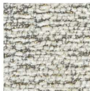
PIETRA 30085-006 VELLO D'ORO