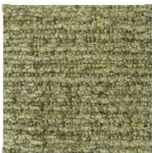
TIGLIO 30085-019 VELLO D'ORO