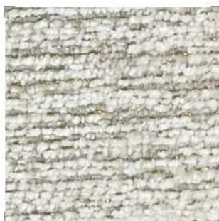
SABBIA 30085-002 VELLO D'ORO