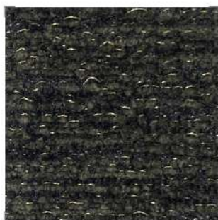
MUSCHIO 30085-020 VELLO D'ORO