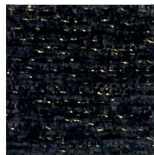
NERO 30085-009 VELLO D'ORO