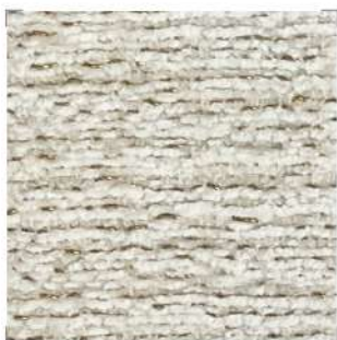
AVORIO 30085-001 VELLO D'ORO