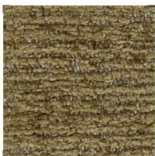
NOCE 30085-004 VELLO D'ORO