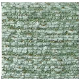
ACQUA 30085-016 VELLO D'ORO