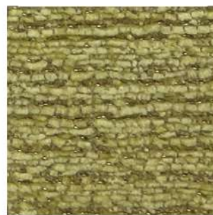
SALICE 30085-018 VELLO D'ORO