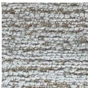
GRIGIO 30085-007 VELLO D'ORO