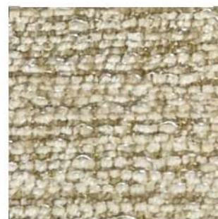
LEGNO 30085-003 VELLO D'ORO